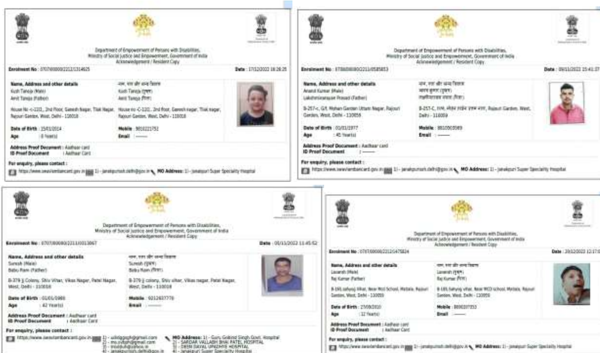
Receipts of Disability Certificate (DC) & Unique Disability Identity Card (UDID) which were applied online by ASRA CBR Team

DC-Disability Certificate, UDID- Unique Disability Identity Card (UDID), OH- Orthopaedically Handicapped