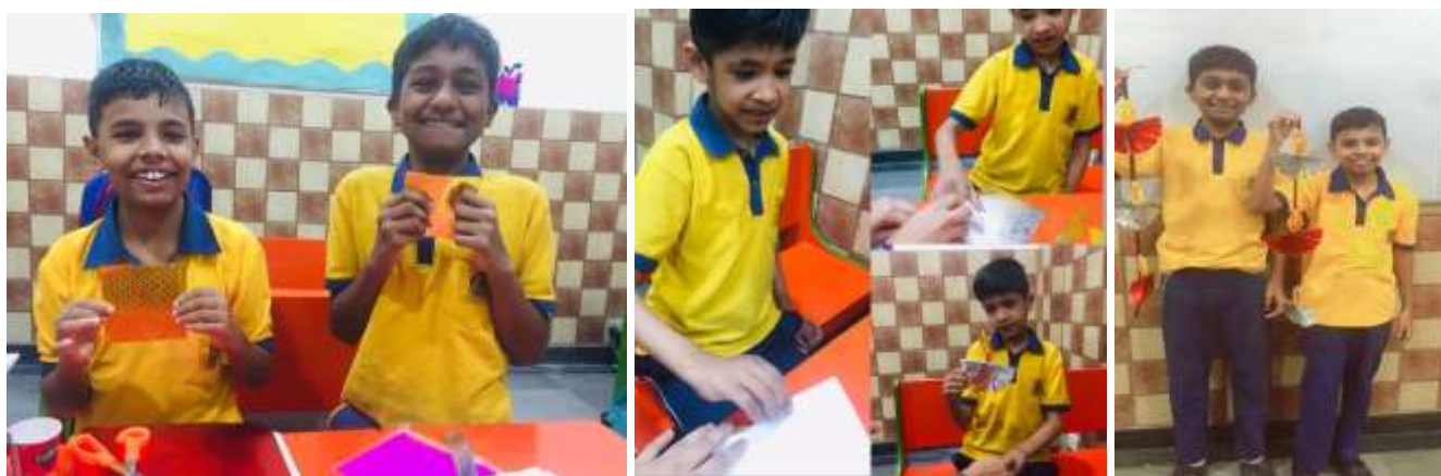
Diwali decoration activity organized by Special Educators for students of AIRTC