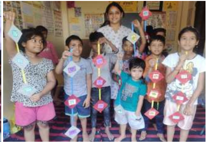
Diwali decoration workshop held at Dwarka sec-16 Education Centre