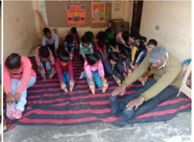
Workshop on 'Breathing exercises' held at Shiv Vihar Education Centre