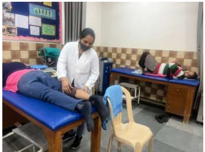
Patients getting Physiotherapy at ASRA Head Office

Following are the number of patients who were registered and treated in the Physiotherapy department during the quarter under report: