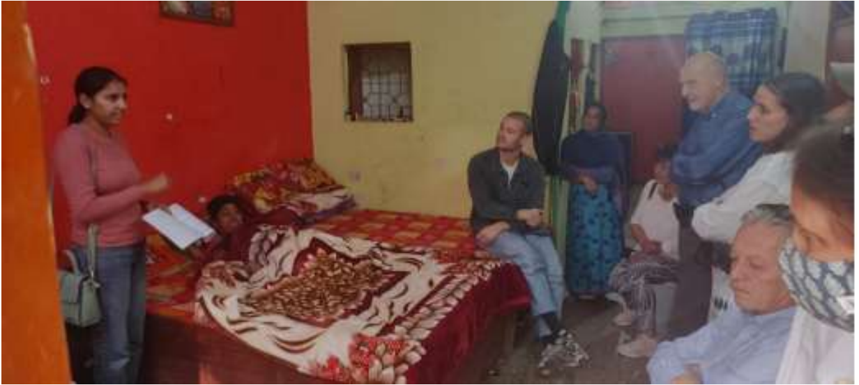
Honorable Delegates along with ASRA CBR Team during home visit of ASRA's beneficiaries at Nangli Dairy community