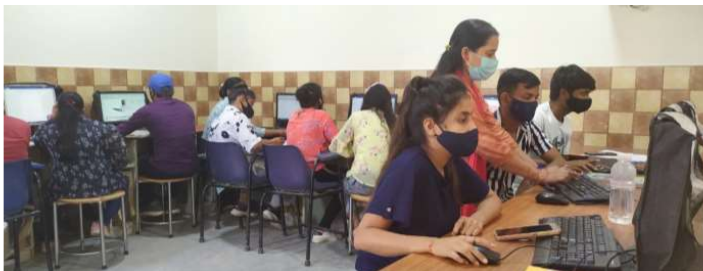
Computer Theory Classes at ASRA Head Office