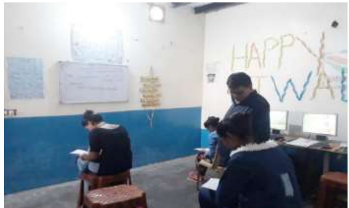
Examination at Hoshiyarpur Village, Noida computer centre

Computer Training at Hoshiyarpur Village, Noida - Computer Training Centre at Hoshiyarpur village, NOIDA was opened in December 2021 under ASRA CBR program. Total ten students have been enrolled during the quarter under report. Examination of four Computer Centre students was conducted on 21 st November 2022.