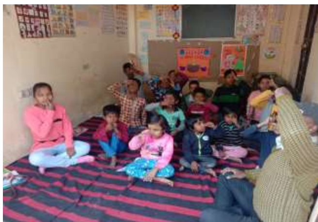
Breathing Exercise Workshop for Students of CBR-Shiv Vihar