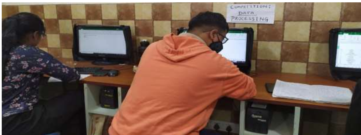
Data Processing Competition

Competition: a. "Data Processing" Using Excel total no of students 6 participated in this Competition.