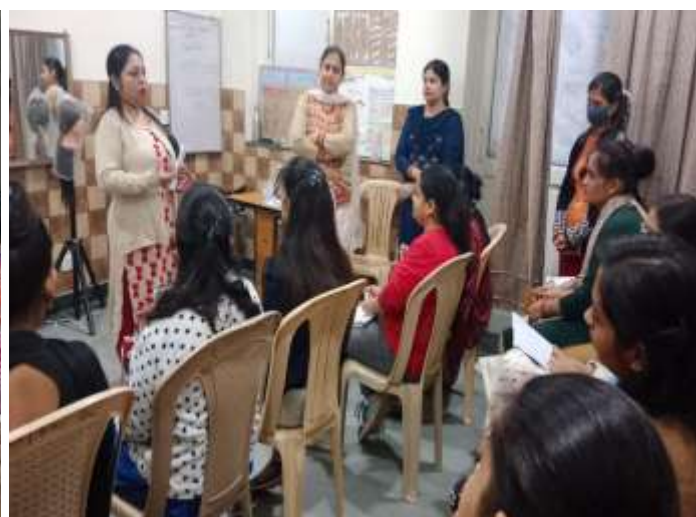
Awareness session on occasion of International Day for Persons with Disabilities