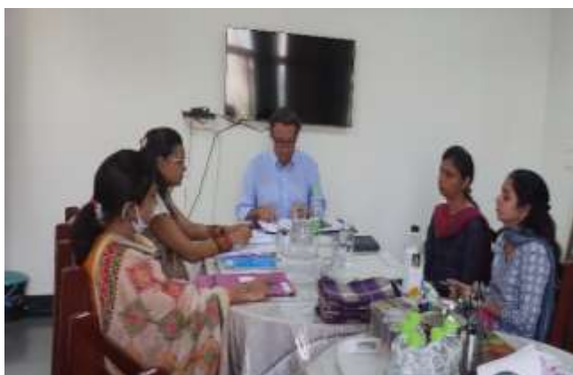
Meeting held between President AFS & the Unit Heads