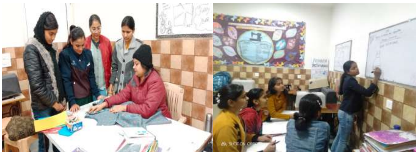
Tailoring theory class (left) Fashion designing theory class (right)