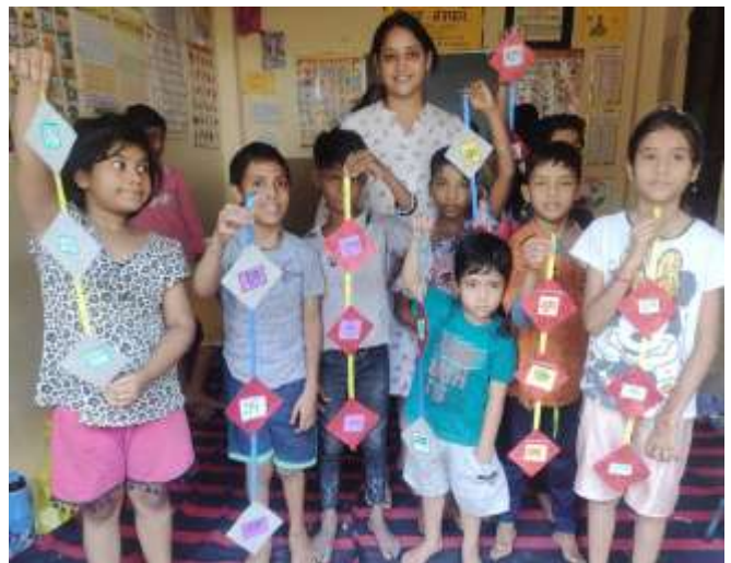
Diwali Workshop, Shiv Vihar community