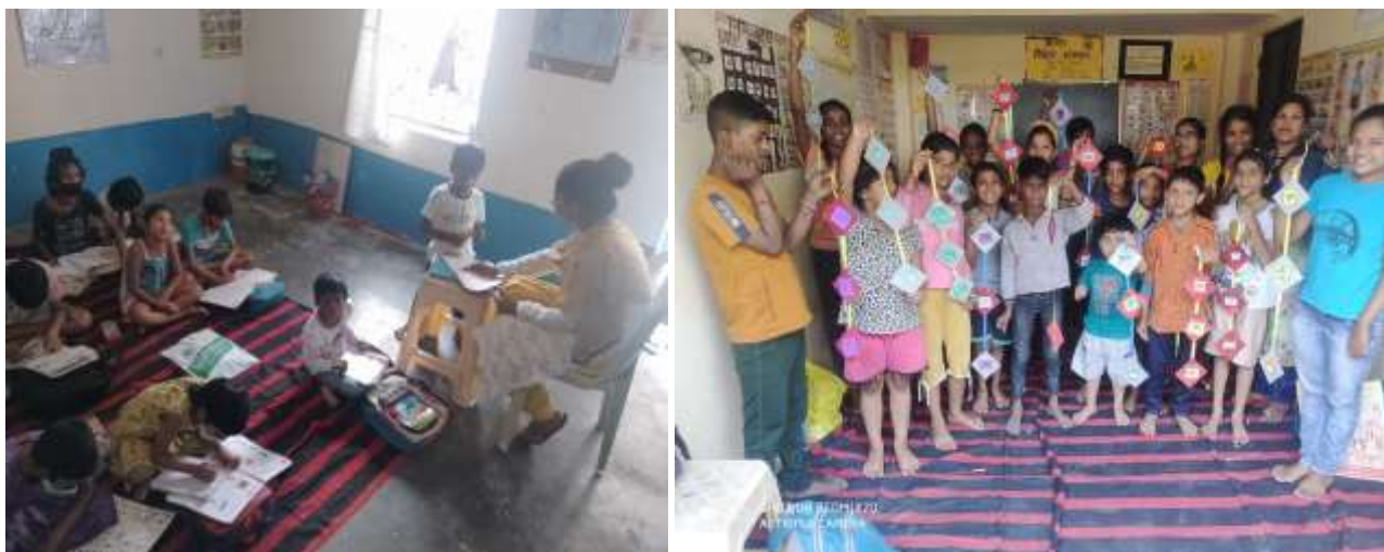
Education Centre, Hoshiyarpur Noida (left) and Shiv Vihar Education Centre (right)

Restructuring & reorganizing of ASRA's Education program was carried out in adopted slum communities namely Shiv Vihar, Dwarka Sec-16, Hoshiyarpur village, Noida. & Pappankalan. Steps were initiated towards identifying & enrolling interested who were interested in continuing their studies under the Education program. 88 children including 17 CwDs at Shiv Vihar education centre, 15 children including 1 CwD at Pappankalan education centre & 25 children including 1 CwD at Hoshiyarpur village, Noida education centre have been enrolled during the quarter under report.