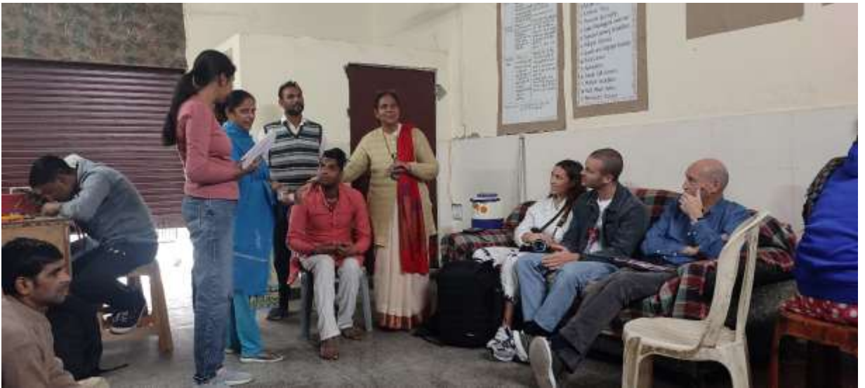
Honorable Delegates interacting with PwD beneficiaries at CBR Project Office, Pappankalan community