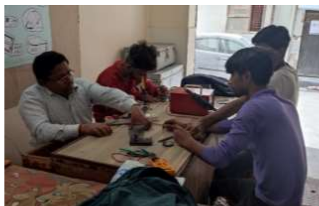
Mobile Repairing Class at Pappankalan community

The Mobile Repairing program resumed in Pappankalan & Shiv Vihar communities under CBR during the quarter under report. New needy students from the communities were enrolled. Regular classes are being conducted, Seven students were enrolled in the course & training is in progress.