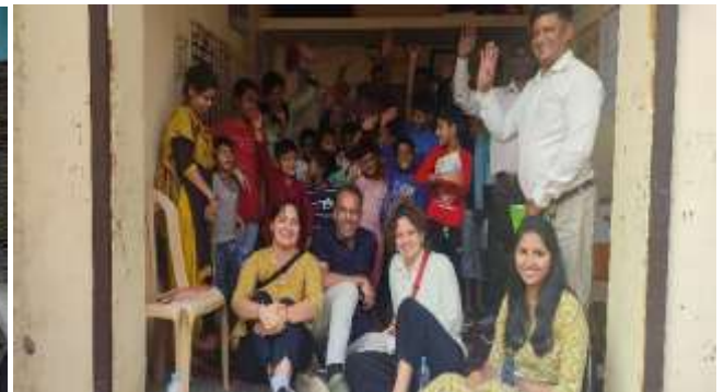
Delegates during home visits of beneficiaries in Pappankalan slum community (left) and at Education Centre in Shiv Vihar community (Right)