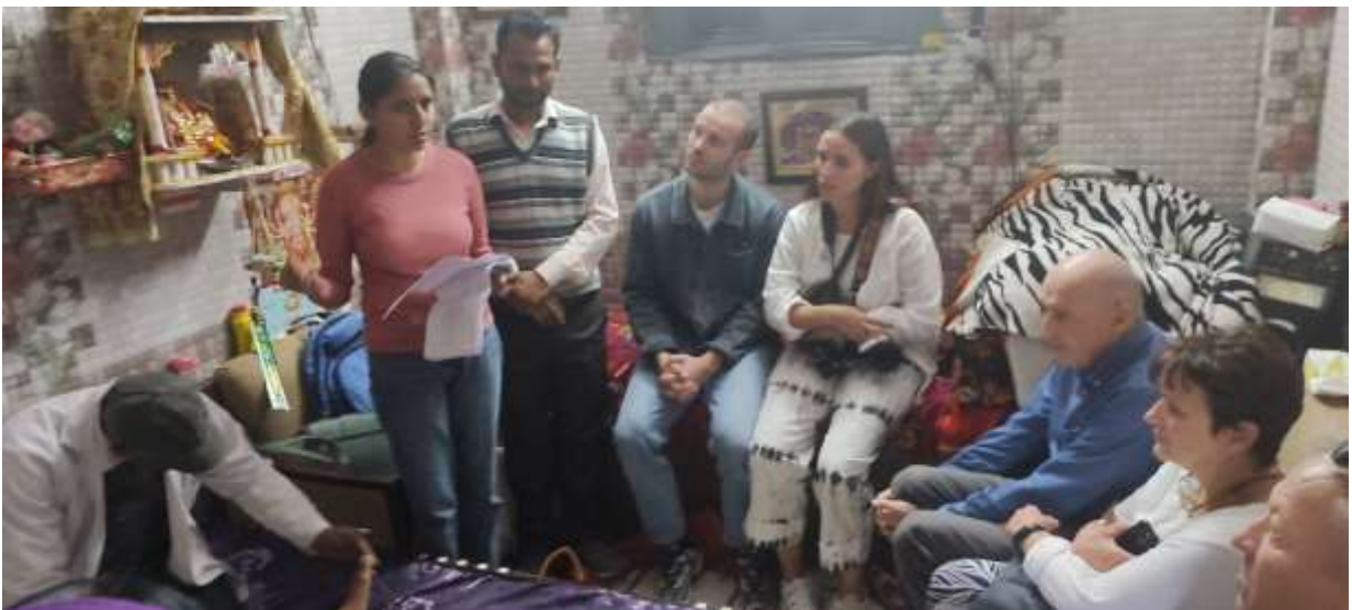
Honorable Delegates along with ASRA CBR Team during home visit of ASRA's beneficiaries at Nangli Dairy community