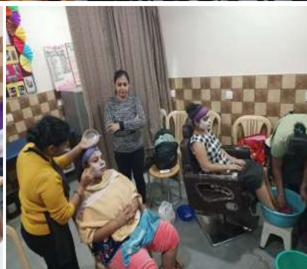
Examination of Vocational Trainings