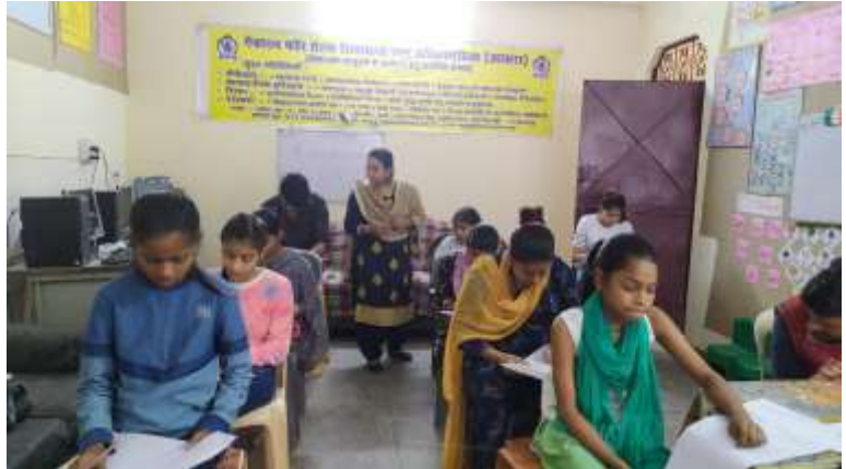
Examination at Pappankalan computer centre