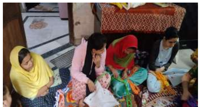
Macrame Craft Training