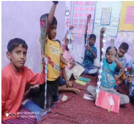
Diwali Workshop, Dwarka Sec-16 community