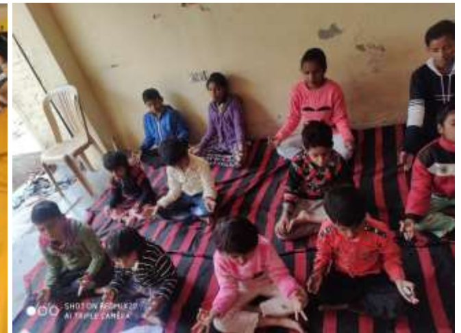
Fitness Workshop held at Shiv Vihar Education Centre