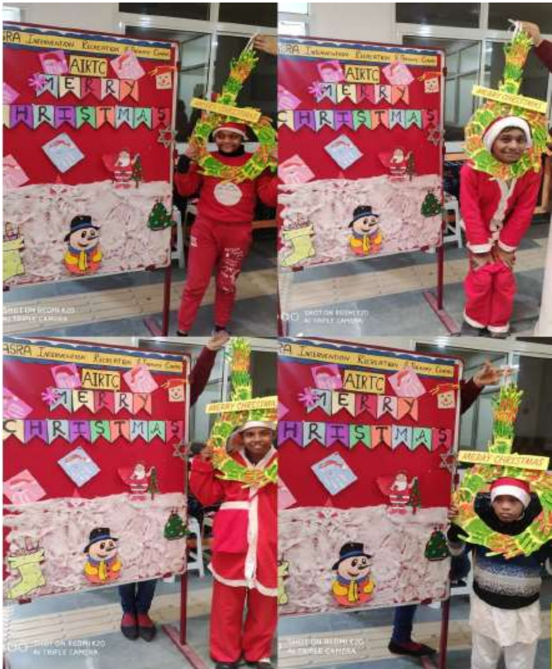
Christmas celebrations with the AIRTC students