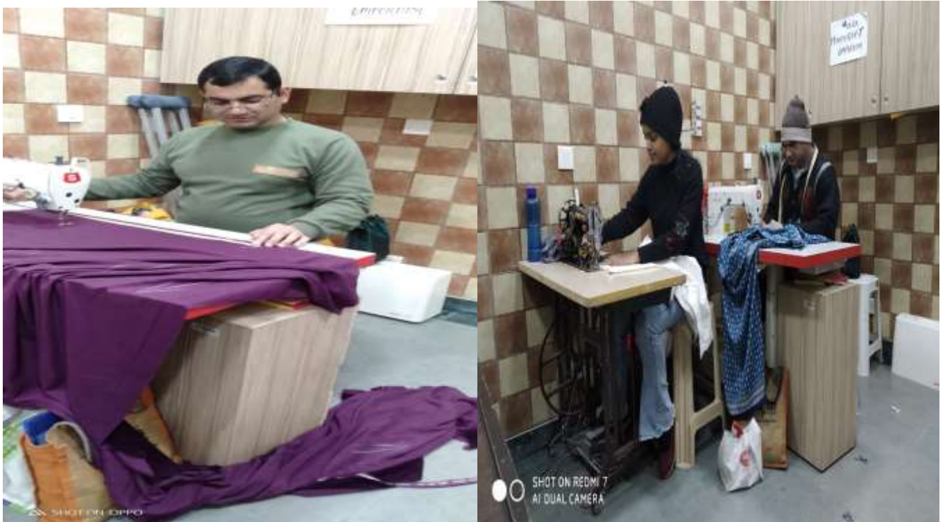
Order Work at ASRA Head Office