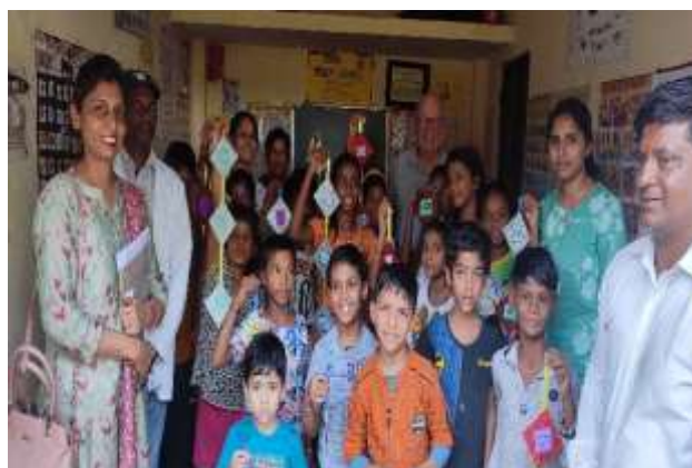
Honorable delegates at ASRA Education centre in Shiv Vihar slum community