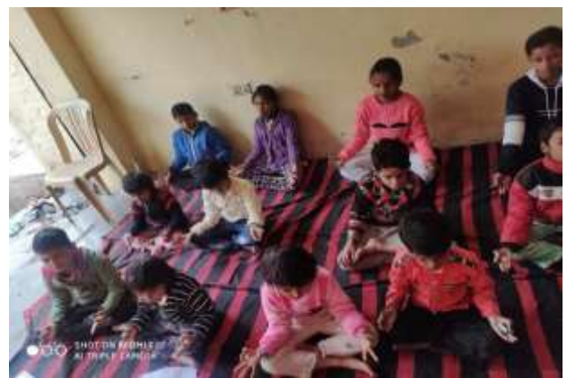
Fitness Workshop at Shiv Vihar community