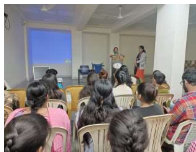
International day for person with disability celebration with vocational training students