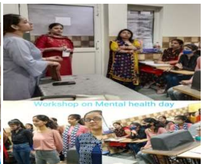
World Mental Health Day with Vocational Training Students