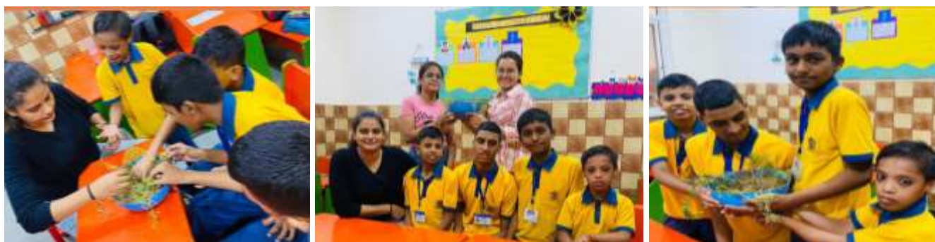
World Mental Health Day activity organized by Special Educators for students of AIRTC