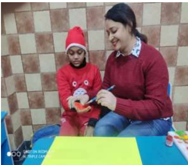
Christmas Workshop with AIRTC Students