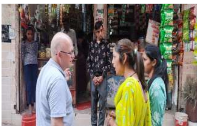
Honorable delegates along with CBR Team during home visits of ASRA's beneficiaries in Shiv Vihar slum community