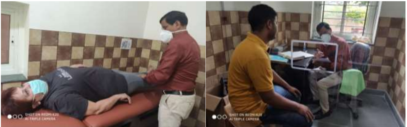
Assessment of OPD patients by Orthopedic Surgeon