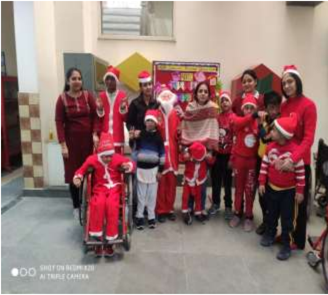
Christmas Celebration with AIRTC Students