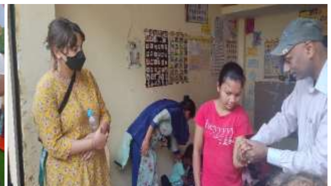
Delegates with the students of AIRTC (left) and at Shiv Vihar Education Centre with the Physiotherapist (right)