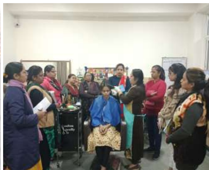
Workshop on Hair Care Tips for Winters