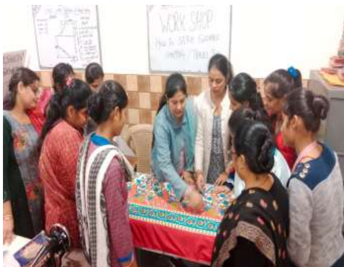
Workshop on stitching Shopping/Travel bags