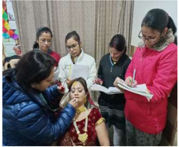
Students of Beauty Culture attending Bridal Make-up class at ASRA HQ