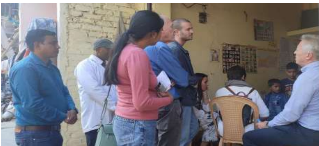
Honorable Delegates at Education Centre in Shiv Vihar community