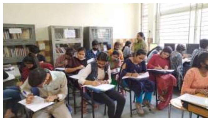
Computer Training Course Examination held at ARTC Head Quarter