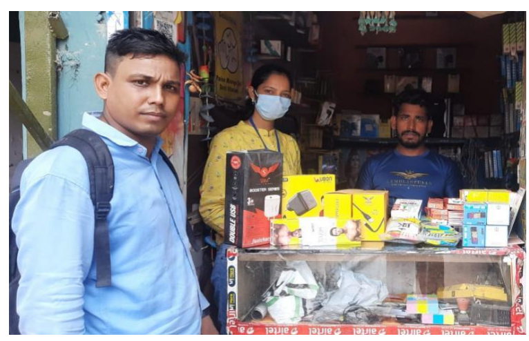
ASRA-CBR Team at Sunny Mobile Repairing Shop from T-Camp during Seed Loan providing

program is to promote financial independence and help disabled persons living in slums to earn their livelihood and improve their quality of life. Seed Loan is given exclusively to the disabled beneficiaries of ASRA who are needy and want to be self-reliant. With the help of Seed Loan, they either purchase additional material for their respective enterprise or start a new enterprise which helps them to increase their monthly income. 3 PwDs