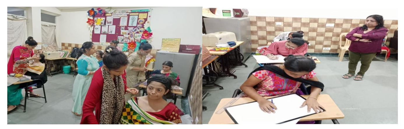
A scene of Examination held at ARTC Head Quarter