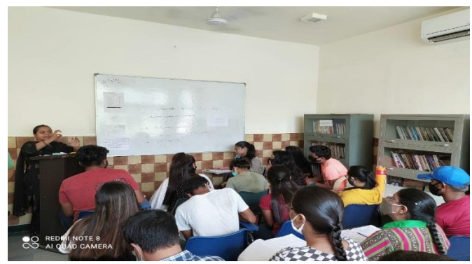
Workshop on Tie & Dye & Block Printing