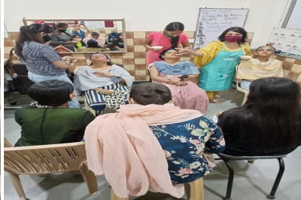
Students of Beauty Culture attending practical classes at ASRA HQ