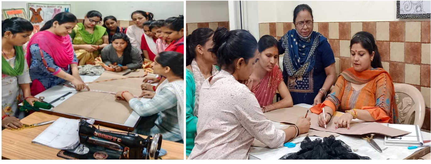
Fashion designing theory class (left) and tailoring theory class (right)