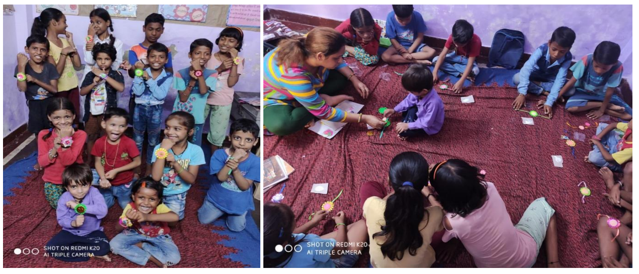
Rakhi Making Activity held at Dwarka sec-16 Education Centre