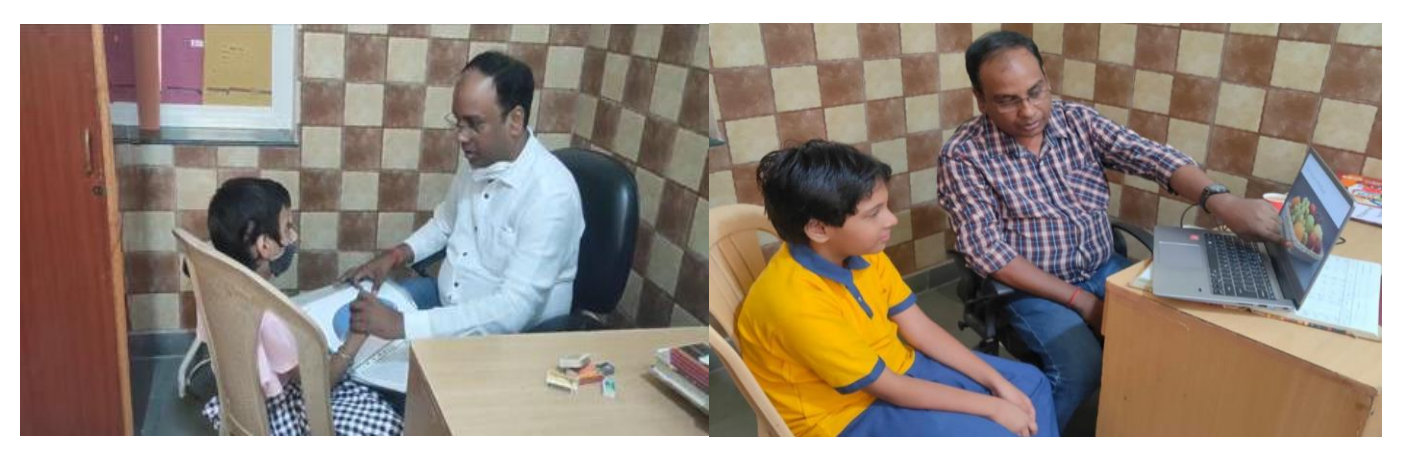
Children getting Speech Therapist at ASRA Head Office

e. Prosthetic & Orthotic Unit: Prosthetic and Orthotic workshop is manufacturing and providing fitment services for persons with disabilities at ASRA Head Office. Rehabilitation of Patients under CBR Project areas are also covered by this unit.