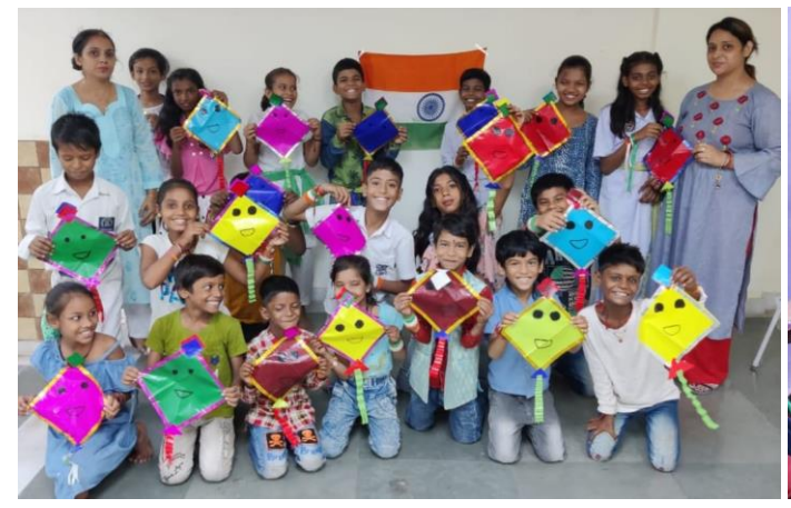
SQAIS O SHOT ON RED<sup>AI</sup> (25) A TRIPLE CAHERA