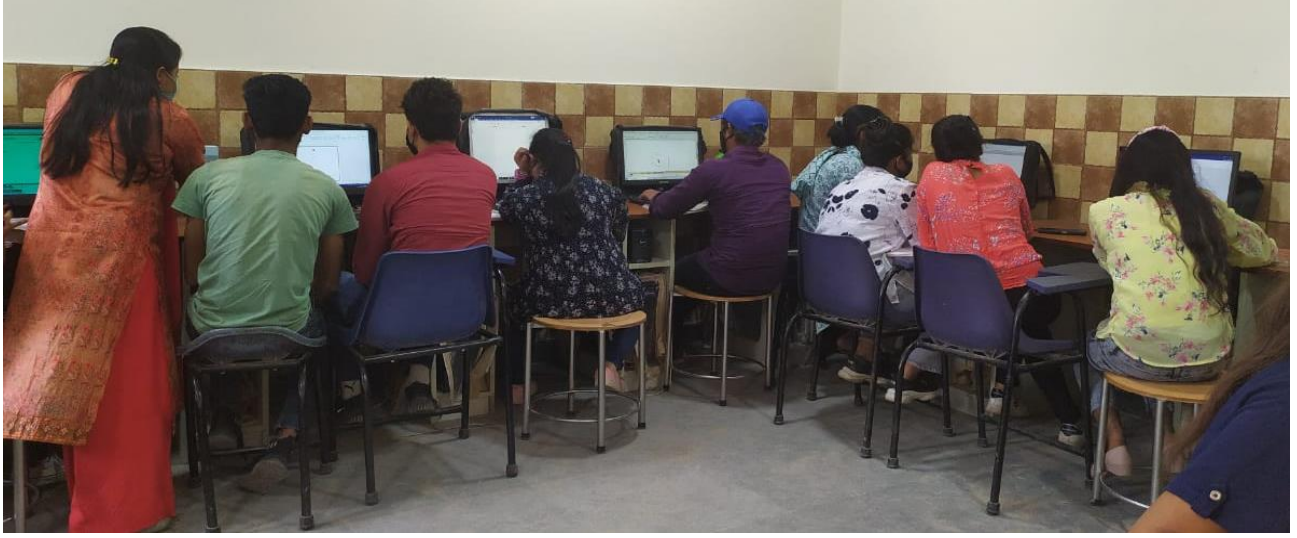
Computer Theory Classes at ASRA Head Quarter