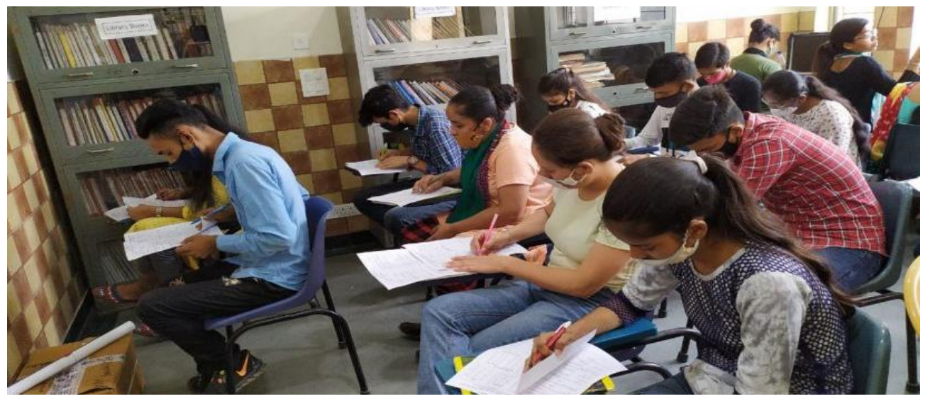
Computer Training Course Examination held at ARTC Head Quarter from 16^{th} to 22^{nd} July 2022, total 26 students appeared in the examination