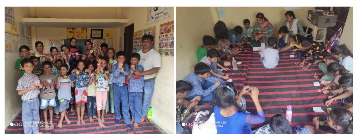
Rakhi Making Activity held at Shiv Vihar Education Centre