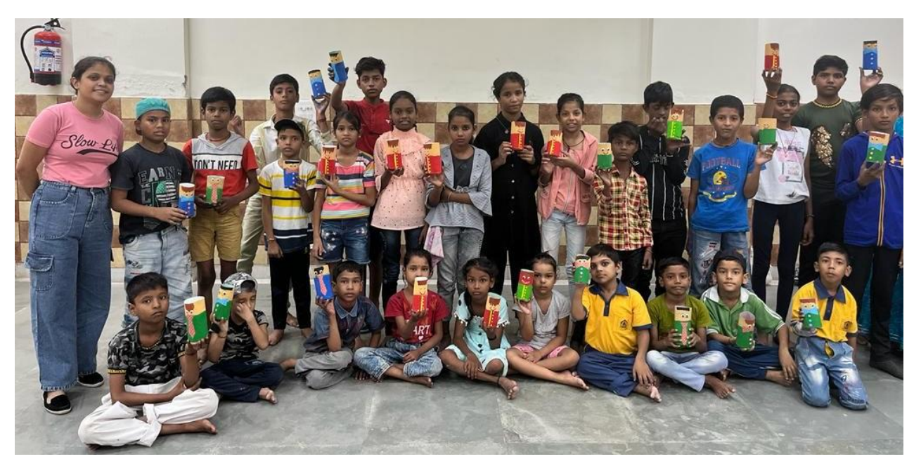
Pen Stand Making Activity held at ASRA Head Office organized by AIRTC Special Educator for children of Shiv Vihar education centre