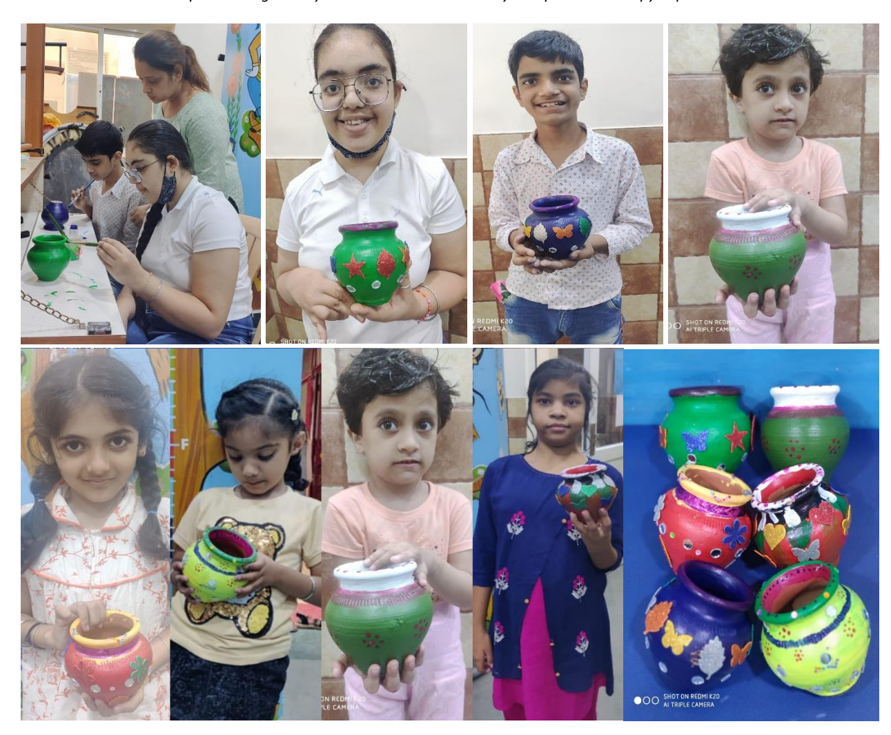
Activity\ of\ Matki\ Decoration\ and\ peacock\ painting\ by\ hand\ on\ the\ occasion\ of\ Janmashtami