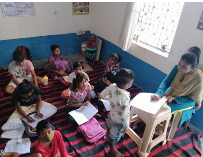
Children attending classes at Shiv Vihar (left) and Hoshiyarpur village education centre (right)