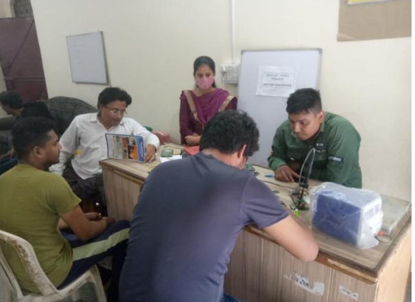
Theory Examination of Mobile Repairing Students at Pappankalan, Project Office (left) and Practical of Mobile Repairing Students