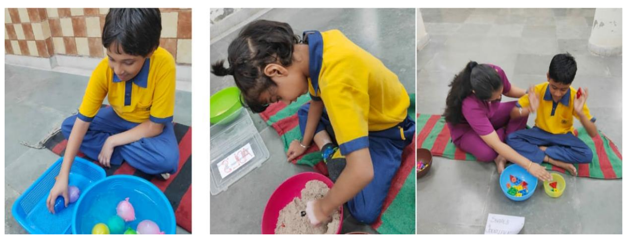
Sensory Tactile activity held with AIRTC Children by physiotherapy department

Parents Teacher Meeting was held on 30<sup>th</sup> July 2022 at AIRTC in the presence of Special Educator, Occupational Therapist and Physiotherapist.