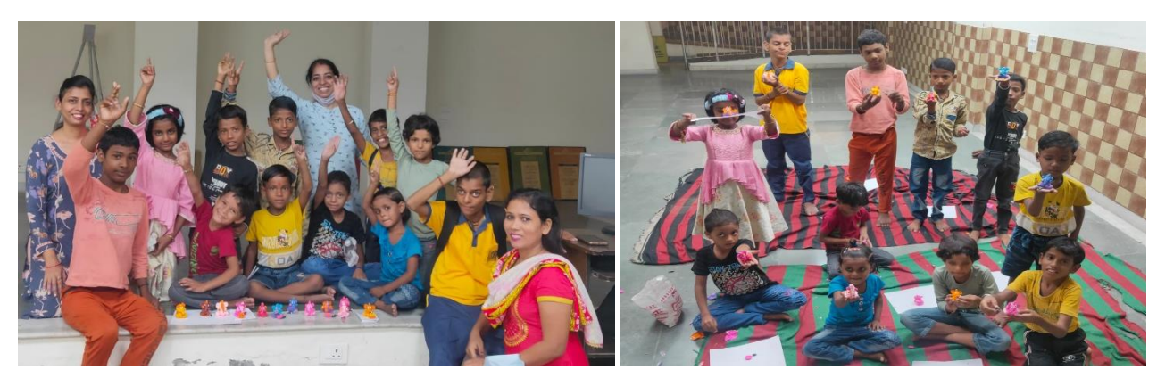
{\it Clay\ Craft\ Activity\ held\ at\ ASRA\ Head\ Office\ organized\ by\ Sr.\ Physiotherapist\ for\ children\ of\ Dwarka\ sec-16\ education\ centre}