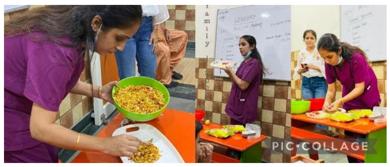
Bhelpuri making activity held with AIRTC Children by occupational therapy department