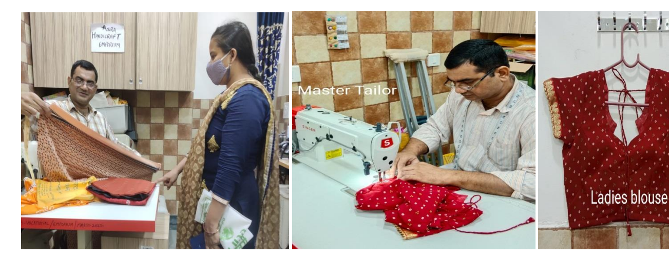
Order Work at ASRA Head Office