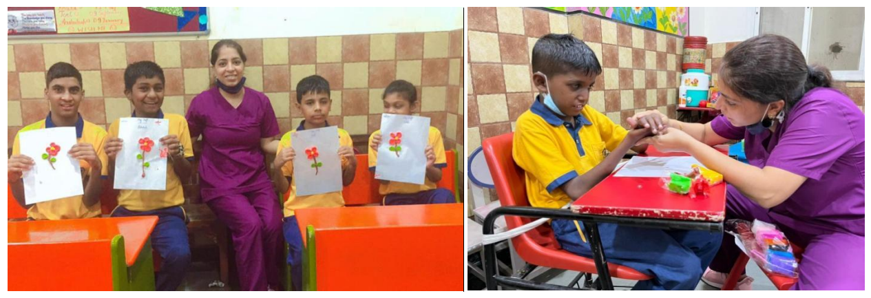
Clay Craft activity held with AIRTC Children by physiotherapy department