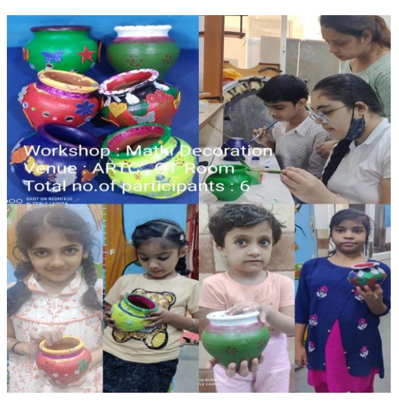
Matki decoration workshop with ARTC patients