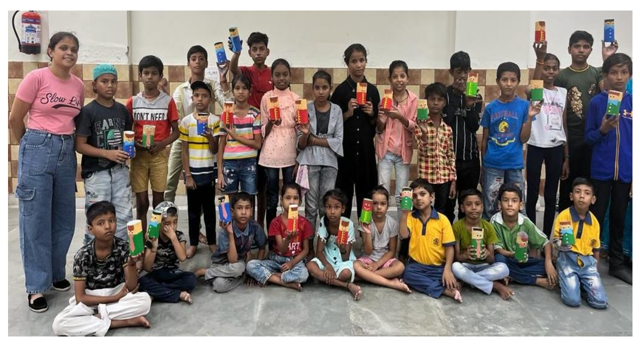
Special Educators of AIRTC organised an activity on Pen Stand for students of ASRA's education centre