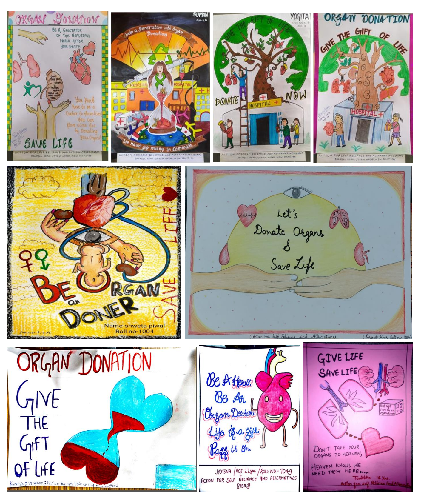
Posters designed by students on Organ Donation

Students of vocational training courses participated and designed posters for poster contest for a cause on theme organ donation