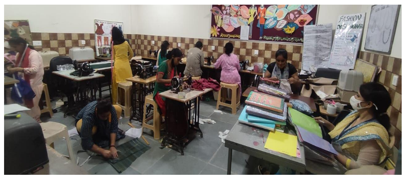
Fashion Designing, Tailoring & Beauty Culture Course Examination held at ARTC Head Quarter, total 17 students appeared in the examination