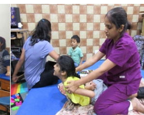
Children getting Speech Therapy at ASRA Head Office