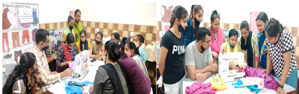
Three days' workshop 'How to Operate Overlock Stitch Magic & Juki Machines' organised by Tailoring & Handicraft Unit