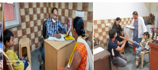
Prosthesis & Orthosis Engineer taking measurement of CwDs for fabricating the appliances