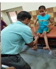
Physiotherapist providing electrotherapy to patients