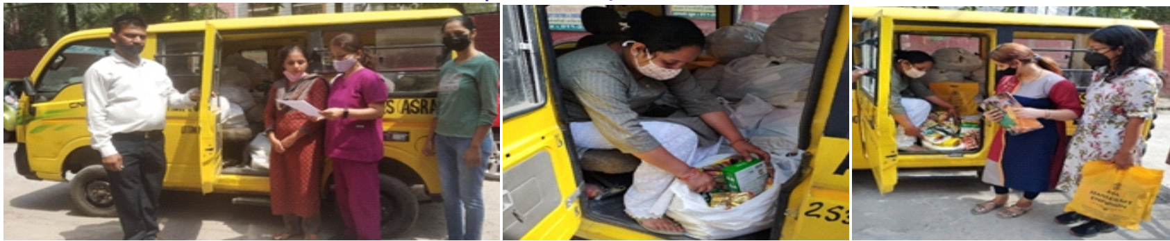
CBR Team doing final checks before distribution of 2 kits / 5 kits