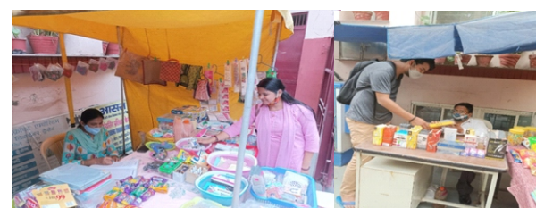
ASRA's Handicraft Haat and Mobile Repairing Haat at ASRA Head Office