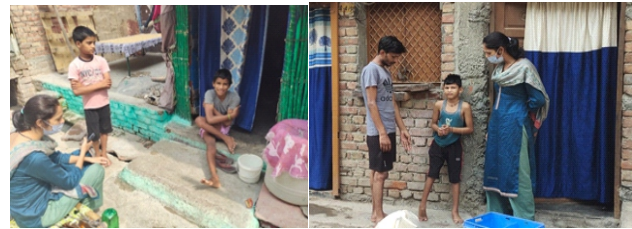
Survey conducted by CBR Team at Holambi Kalan slum community

For the expansion of CBR Program, ASRA CBR Team has conducted survey in new slum communities namely Holambi Kalan, Metro Vihar. A total 12 CwDs / PwDs are identified during the baseline survey.