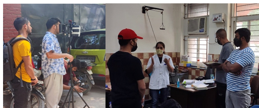
Observatory visit & shooting of Mission film on ASRA by the team of Shades & Motion Creative Hub Pvt. Ltd.

A shooting of a Mission film on ASRA for a duration of two & a half minutes was conducted by a team of professionals from 'Shades & Motion Creative Hub Pvt. Ltd.' on 27 th & 28 th June 2022. The shooting covered major activities of ASRA i.e. CBR, ARTC & AIRTC.