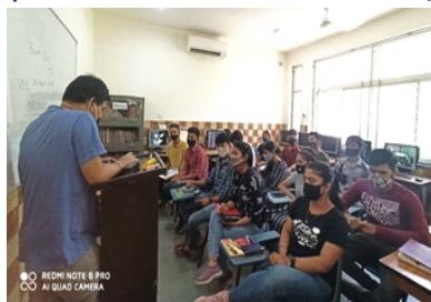
Computer Theory Classes at ASRA Head Office