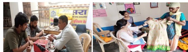
Mobile Repairing Class at ASRA Head Office Tailoring Centre at Hoshiyarpur Centre, NOIDA

Need emerged from beneficiaries in Hoshiyarpur, NODIA to start the Vocational Training Program in Cutting & Tailoring . This was initiated in the newly rented room in NOIDA Centre . Cutting & Tailoring Centre at Hoshiyarpur, NOIDA was opened in March 2022 under ASRA CBR program. During the quarter under report, total four students enrolled, out of which one student who is speech & hearing impaired & illiterate completed her course. Unfortunately, due to less enrollment, tailoring program was wind up in Hoshiyarpur on 30 th June 2022.