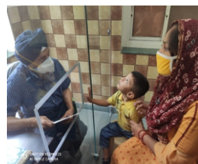
Assessment through Orthopaedic Surgeon & General Physician