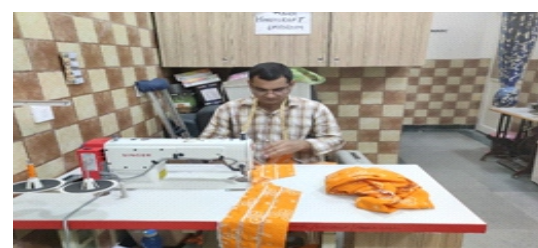
Order work on progress