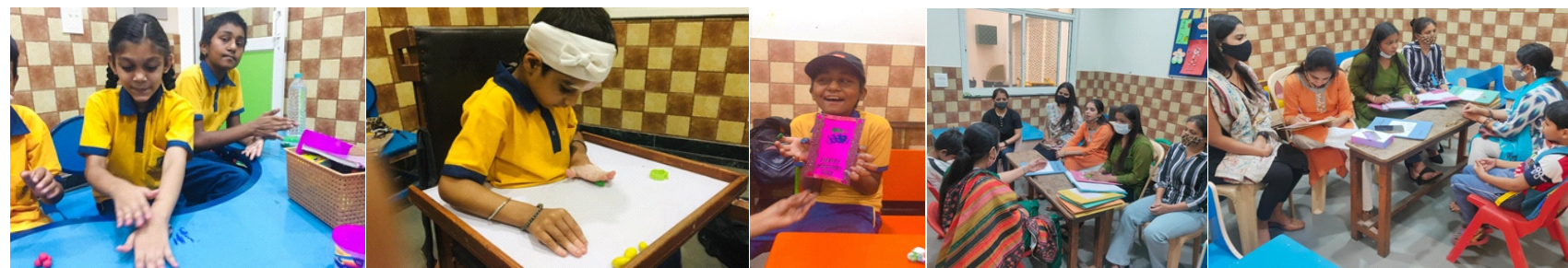
Children of AIRT making clay craft

The students enrolled in AIRT have different types of disabilities, predominantly intellectual disabilities associated with physical & speech & hearing impairments.