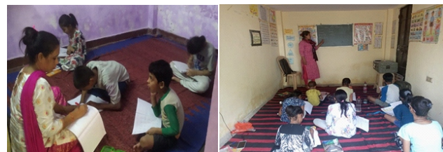
Education Centre at Shiv Vihar (left) & Dwarka Sector-16 (right)

During the quarter under report, a new room has been identified in Bharat Vihar slum community to start Educational & Vocational Programs. Unfortunately, it had to be dropped & education program could not take off.