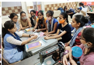
Fashion designing theory class (left) and tailoring theory class (right)