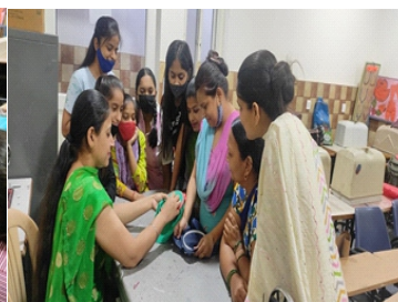
Beauty Culture Practical Classes