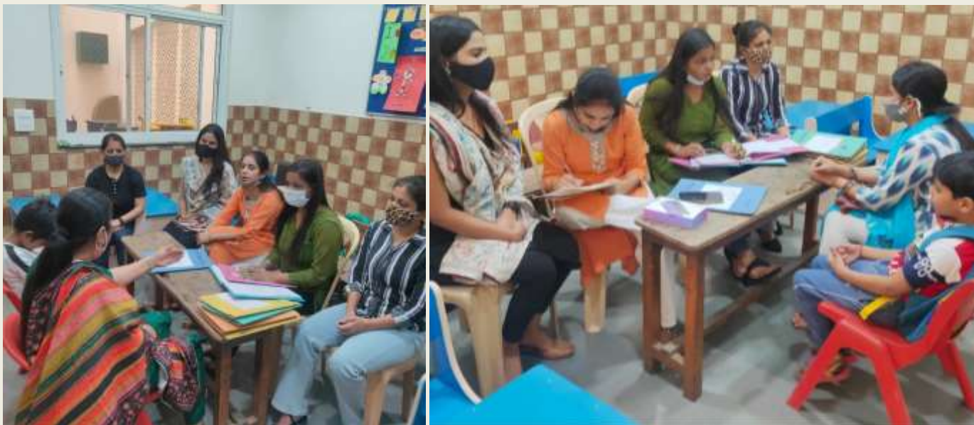
ASRA's PTM Committee with parents during Parents Teacher Meeting held at AIRTC

Parents Teacher Meeting (PTM) was held on 30 th April, 2022 at AIRTC. The main perspective of the PTM was to discuss Individualized Education Plan (IEP) with each parent, future education & therapy goals. Parents were also informed that ASRA's Special Educators are providing special sessions to students through smart education applications in tablets.