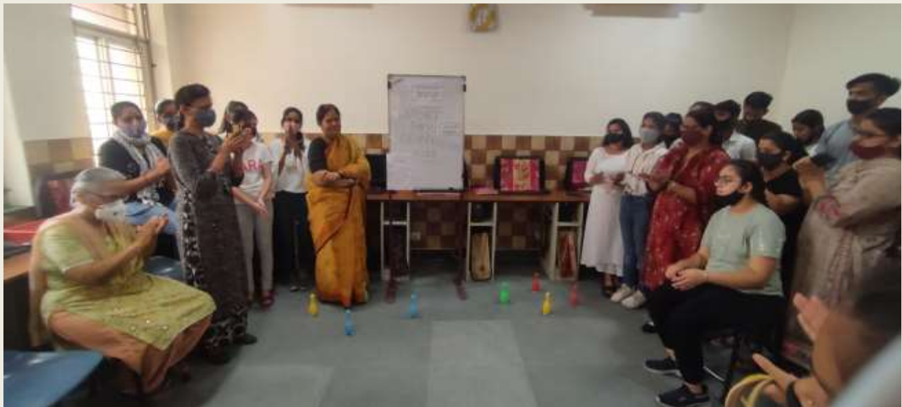
President Founder & Trustee ASRA India motivating students during ASRA Sports Day