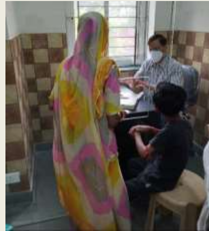
Counselling of parents of a CwDs

b. Physiotherapy: Physiotherapy plays an important role in providing therapeutic management for treating the effects of congenital diseases, illnesses, chronic diseases, neurological conditions, accidents and the pressures and strains of everyday life.