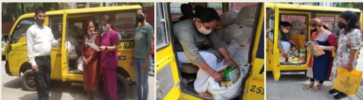
CBR Team doing final checks before distribution of 2 kits / 5 kits

During the quarter under report, 124 children received Two Kits & Five Kits in ASRA Head Office as well as at their door steps in the communities.