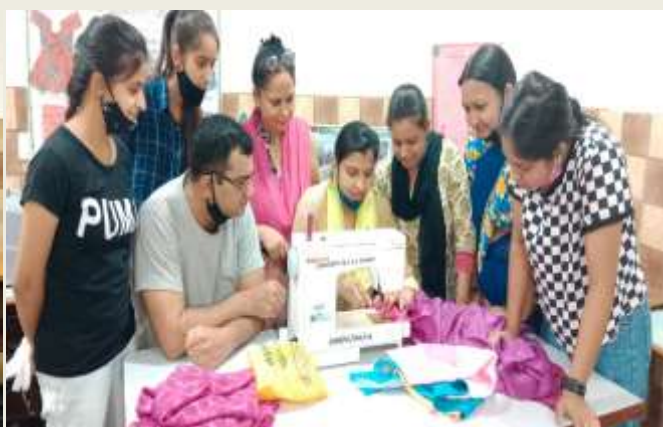
Three days' workshop 'How to Operate Overlock Stitch Magic & Juki Machines' organised by Tailoring & Handicraft Unit