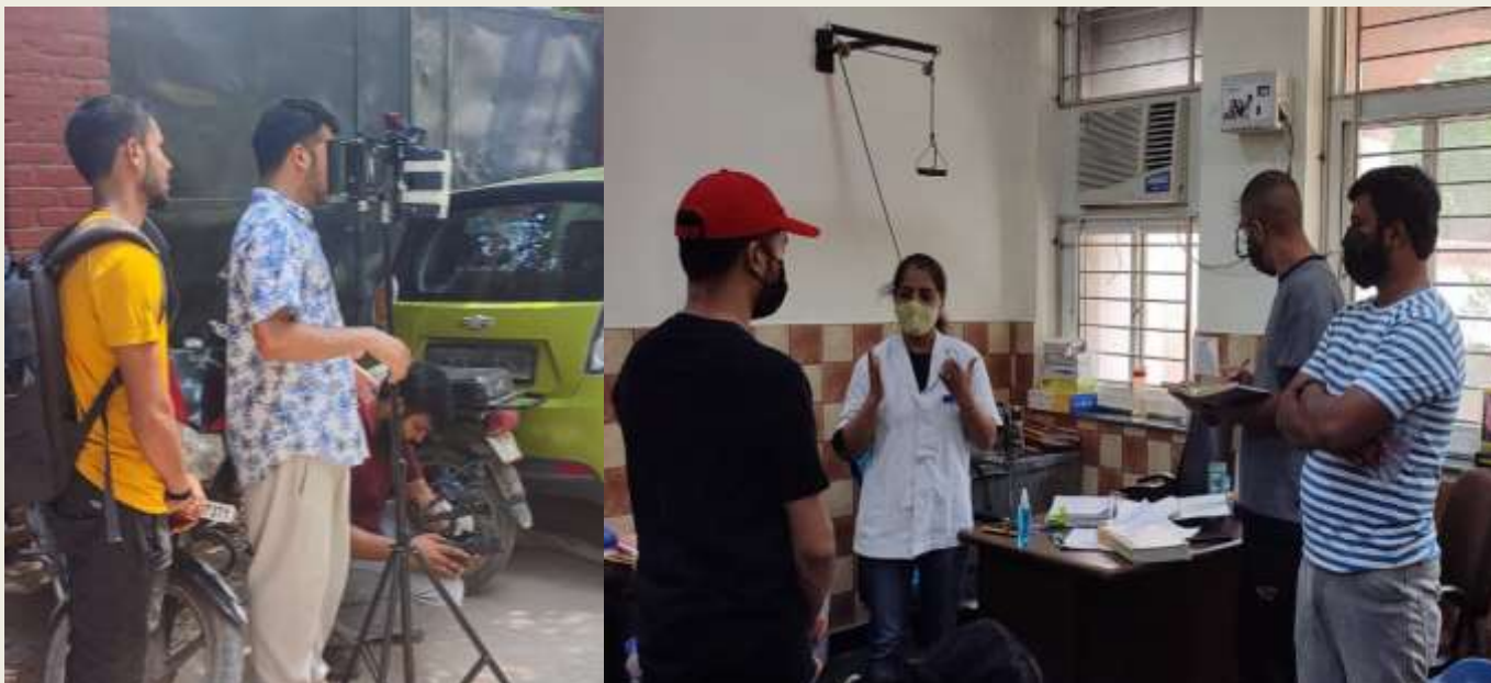
Observatory visit & shooting of Mission film on ASRA by the team of Shades & Motion Creative Hub Pvt. Ltd.

A shooting of a Mission film on ASRA for a duration of two & a half minutes was conducted by a team of professionals from 'Shades & Motion Creative Hub Pvt. Ltd.' on 27 th & 28 th June 2022. The shooting covered major activities of ASRA i.e. CBR, ARTC & AIRTC.