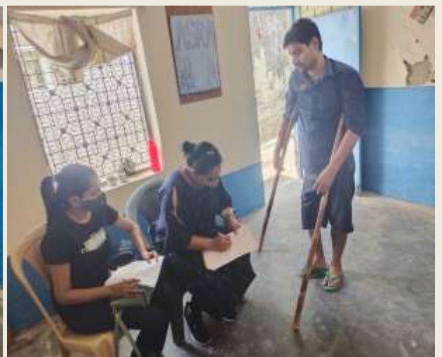
Ongoing applied services of concession & benefits for person with disabilities at Hoshiyarpur, Noida slum community