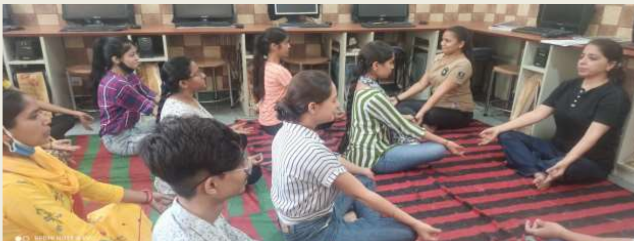
Therapist teaching 'Dhyan Mudra'- a yogic practice to students