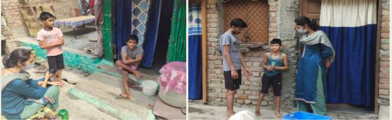
Survey conducted by CBR Team at Holambi Kalan slum community

For the expansion of CBR Program, ASRA CBR Team has conducted survey in new slum communities namely Holambi Kalan, Metro Vihar. A total 12 CwDs / PwDs are identified during the baseline survey.