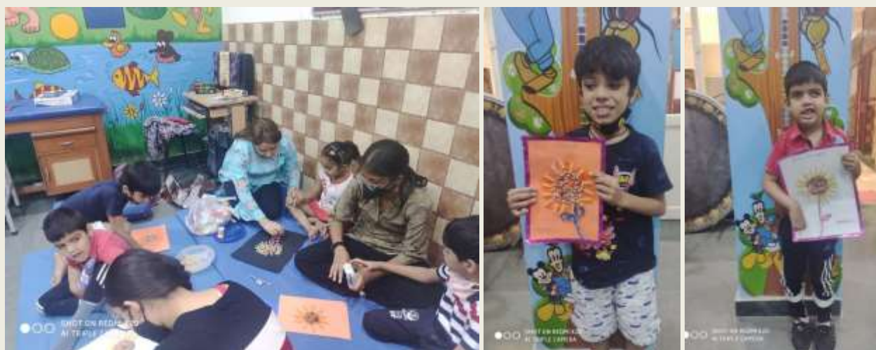
Art & Craft Activity with Pasta and Red Beans to make Sunflower organized by Occupational Therapy Department for patient of Children with Disabilities