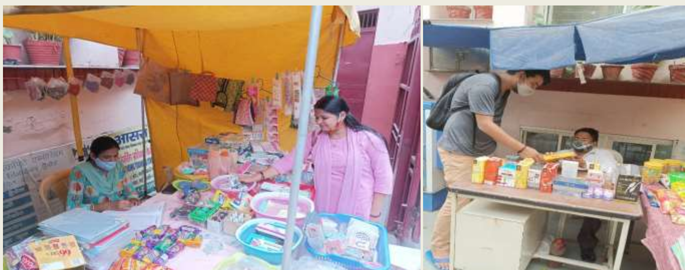
ASRA Haat (Handicraft Haat (left) & Mobile Repairing Haat (right))

The Haat, through its outlet services unit also provides Beauty Culture Services to interested customers.