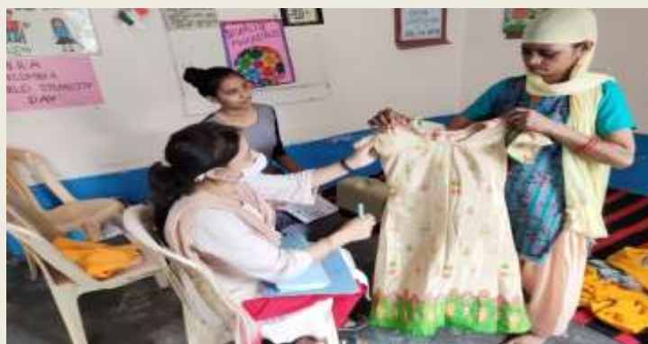
Tailoring Centre at Hoshiyarpur Centre, NOIDA

Need emerged from beneficiaries in Hoshiyarpur, NODIA to start the Vocational Training Program in Cutting & Tailoring . This was initiated in the newly rented room in NOIDA Centre . Cutting & Tailoring Centre at Hoshiyarpur, NOIDA was opened in March 2022 under ASRA CBR program. During the quarter under report, total four students enrolled, out of which one student who is speech & hearing impaired & illiterate completed her course. Unfortunately, due to less enrollment, tailoring program was wind up in Hoshiyarpur on 30 th June 2022.