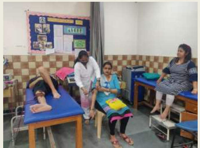
Physiotherapist providing electro therapy to patients

Following are the number of patients who were registered and treated in the Physiotherapy department during the quarter under report: