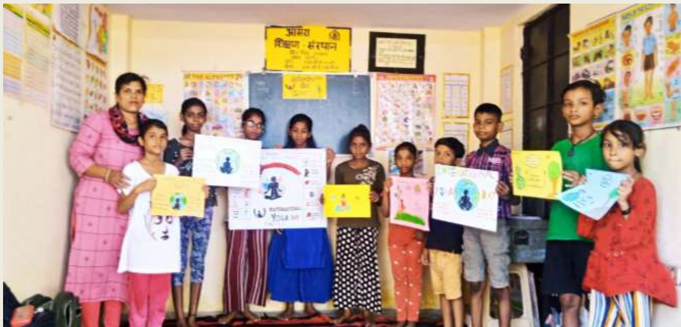
Children of Shiv Vihar Education centre celebrating International yoga day by making posters on Yoga.