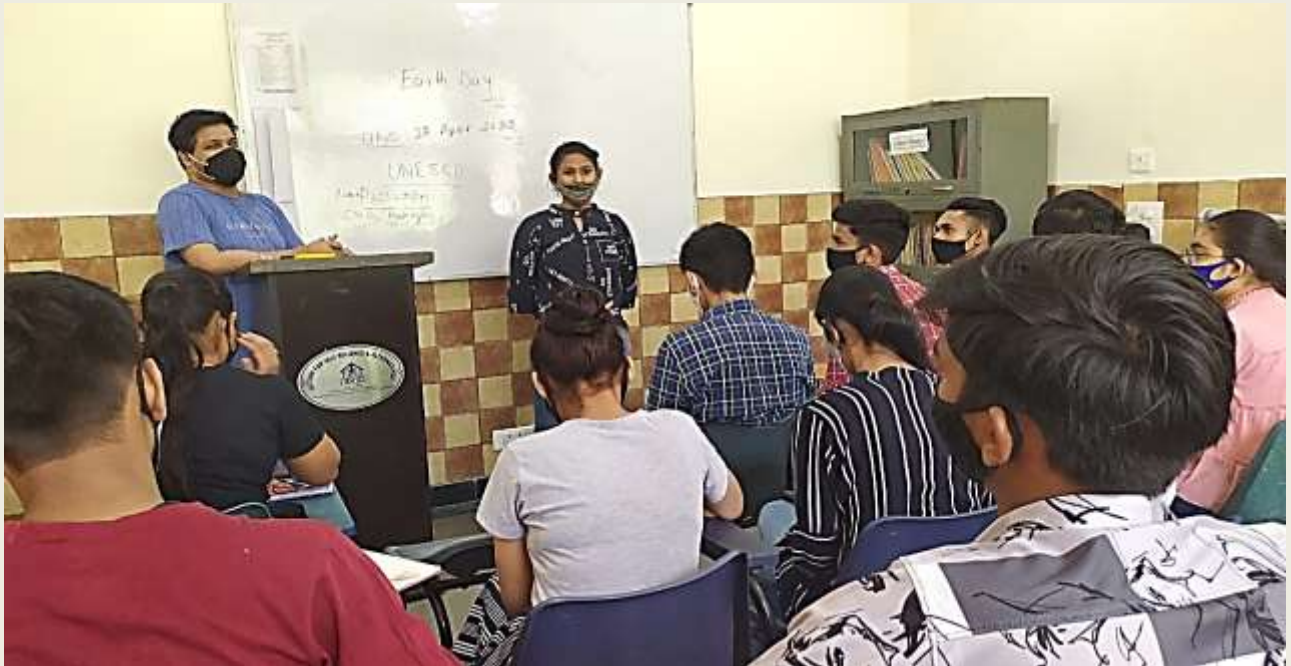
Students of Computer Centre attending session on Earth Day