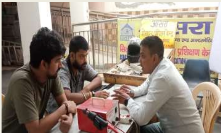
Mobile Repairing Class at ASRA Head Office

The Mobile Repairing program which was running in Pappankalan community under CBR, was merged with the ARTC Vocational Training Programs during COVID period. New needy students from the communities & neighbourhood were enrolled & regular classes are being conducted now at ARTC w.e.f. January 2022. Seven students were admitted for course & training is in progress.