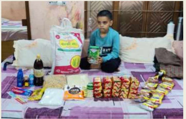
Ojas from Nanhe Park