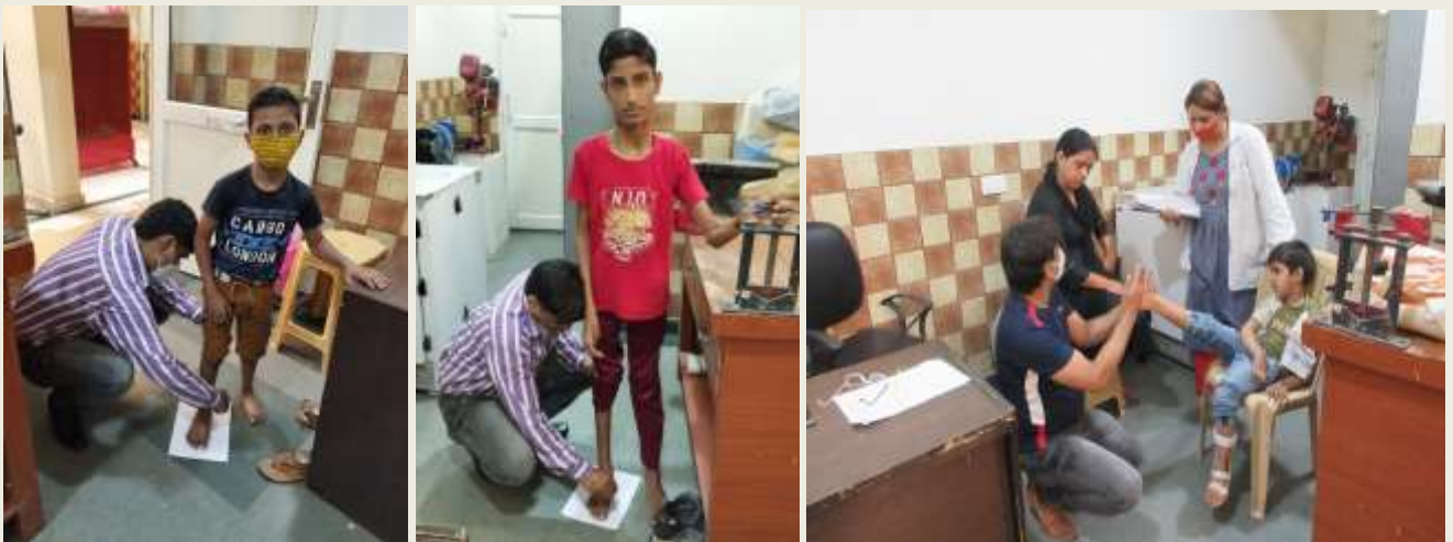
Prosthesis & Orthosis Engineer taking measurement of CwDs for fabricating the appliances