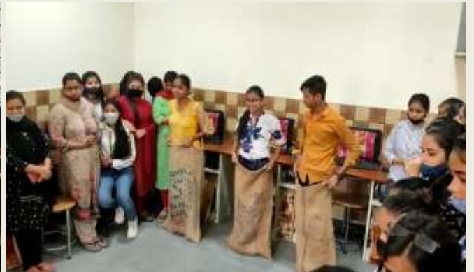
Students enjoying ASRA Sports Day