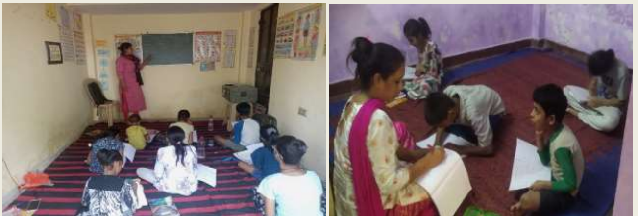
Education Centre at Shiv Vihar (left) & Dwarka Sector-16 (right)

During the quarter under report, a new room has been identified in Bharat Vihar slum community to start Educational & Vocational Programs. Unfortunately, it had to be dropped & education program could not take off.