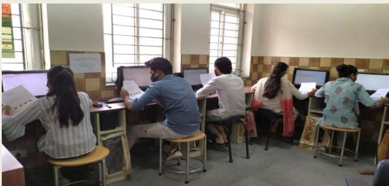
Competition on Web Designing held on 28 th June 2022 organized by Computer Department