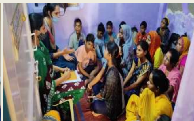
Parents Teacher Meetings were held at ASRA Education Centre at Shiv Vihar and Dwarka Sec-16 slum communities