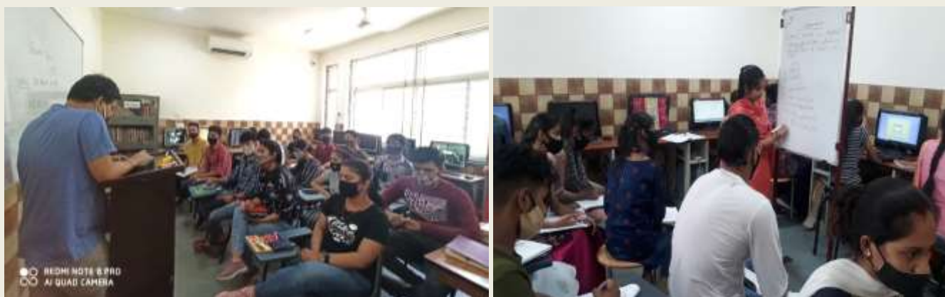
Computer Theory Classes at ASRA Head Office