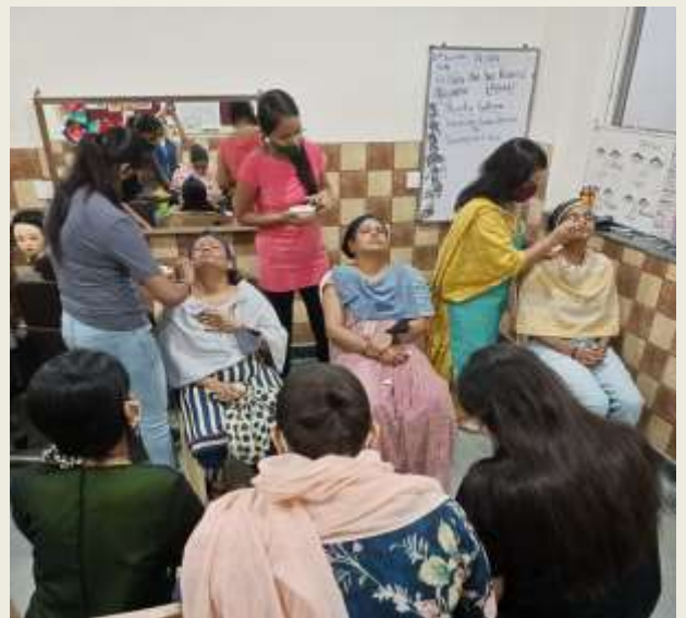
Workshop on 'Skin Care Tips for Summer season' organised by Beauty Culture Unit