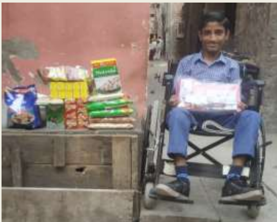
Lucky from Shiv Vihar