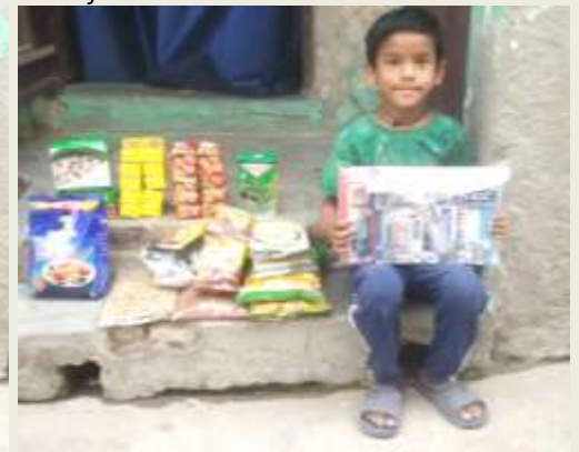
Badal from Shiv Vihar