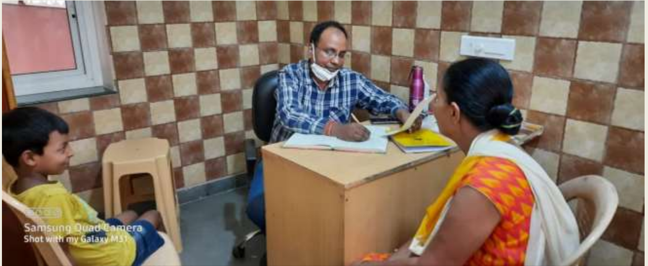
Children getting Speech Therapy at ASRA Head Office