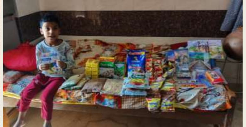
Kunal from Dwarka sec-16