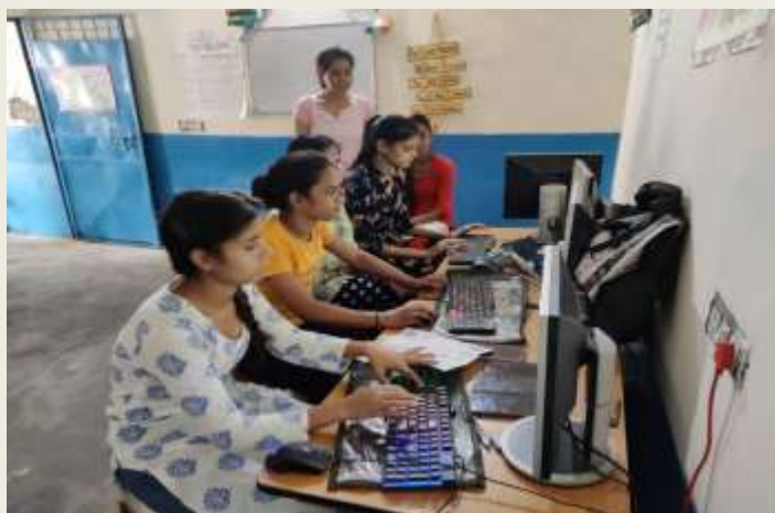
Computer Class at Hoshiyarpur Centre, Noida

Computer Training Centre at Hoshiyarpur village, NOIDA was opened in December 2021 under ASRA CBR program. Total 16 students has been enrolled till June 2022 including two students with disabilities.