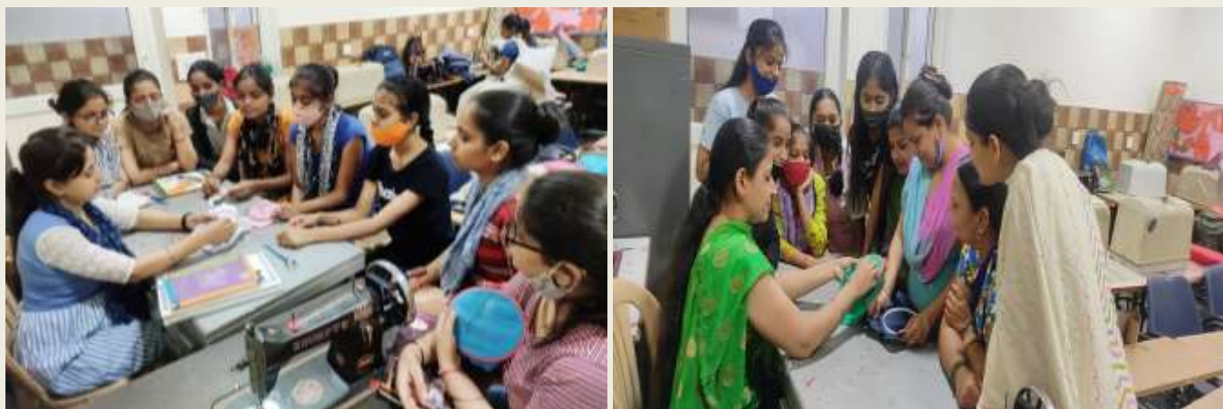
Fashion designing theory class (left) and tailoring theory class (right)