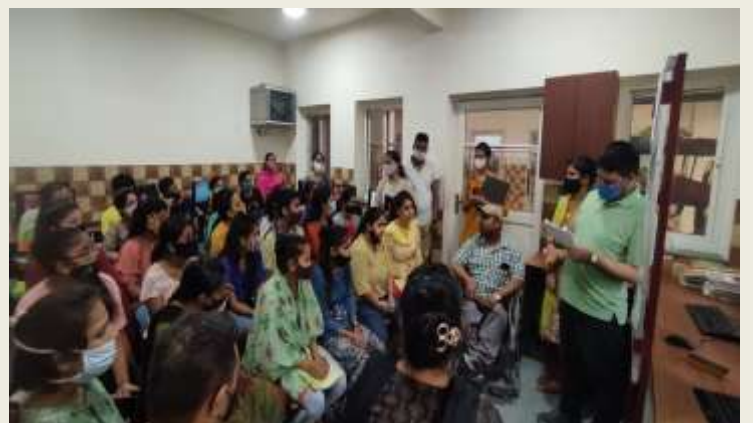
Workshop on 'Hazard of Drug Addiction' organised by Computer Department, ASRA Head Office