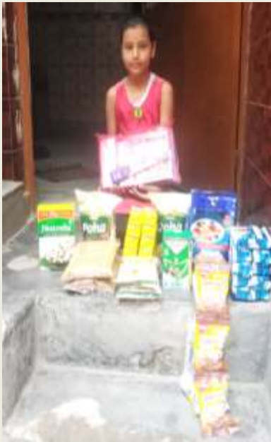
Bhumika from Dwarka sec-16