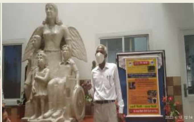
Awareness Session on 'Prevention of Malaria & Dengue Disease' by Malaria Inspector, Municipal Corporation of Delhi