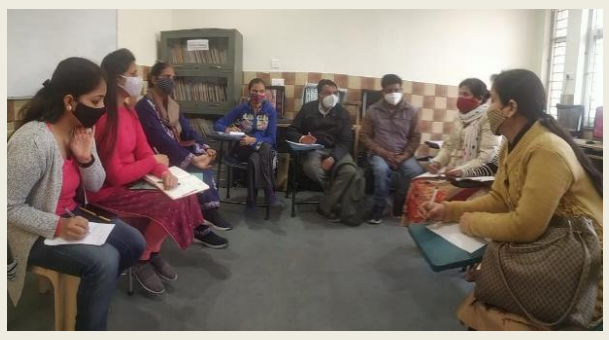
Founder ASRA, Head Office Team and CBR Rehab Workers during a review meeting