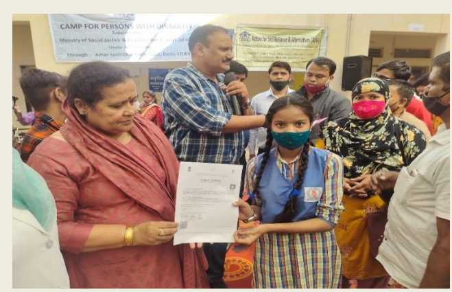
CwD receiving her UDID Card during Camp