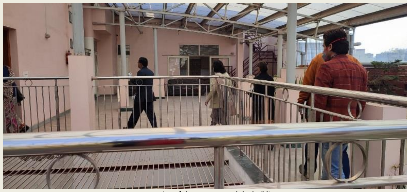
Inspection of the ramp around the building