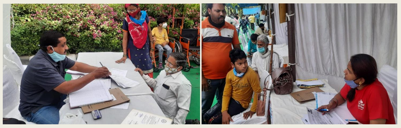
ASRA's PwD beneficiaries registering themselves for Mobility Aids and Appliances during Camp