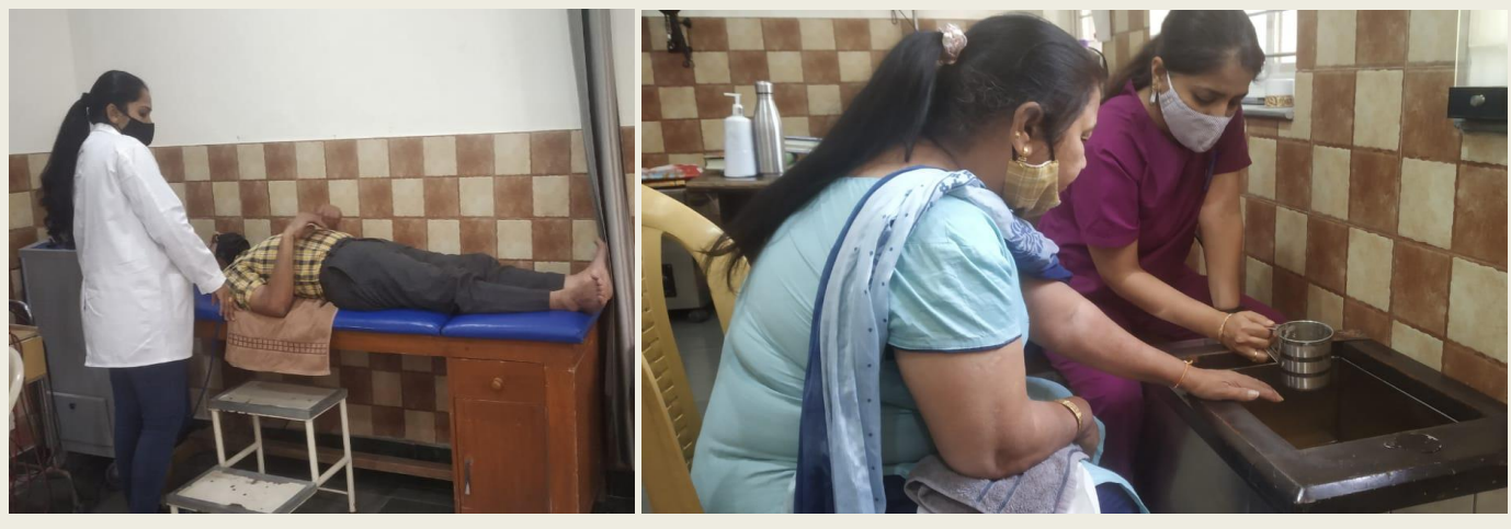
Patients taking Physiotherapy at ASRA Head Office