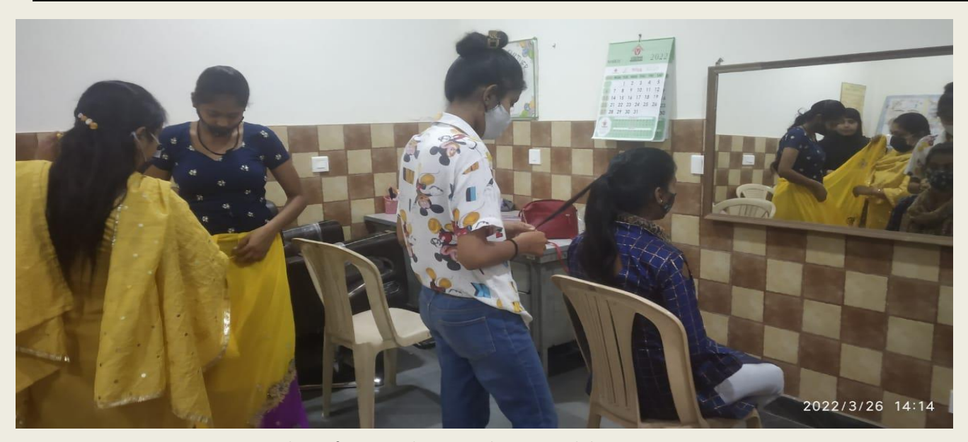
Students of Beauty Culture attending practical classes at ASRA HQ

Examination: Examination of CBR Beauty Culture Program has been conducted digitally in the month of January 2022. Due to COVID-19 and review of CBR Programs, all the vocational training centres have been closed and Total 22 students have appeared in examination which was held on 15<sup>th</sup> January 2022 and all 22 students have cleared the examination.