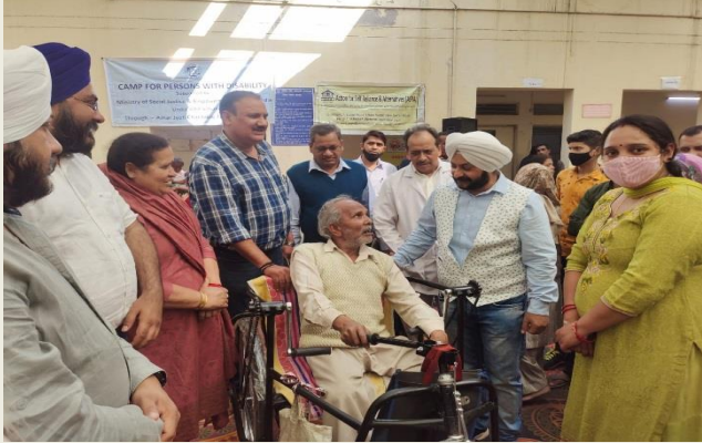
A PwD beneficiaries from Bakkarwalan community receiving Tricycle during Camp