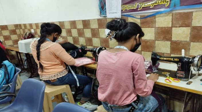
Fashion Designing Theory class at ASRA Head Office