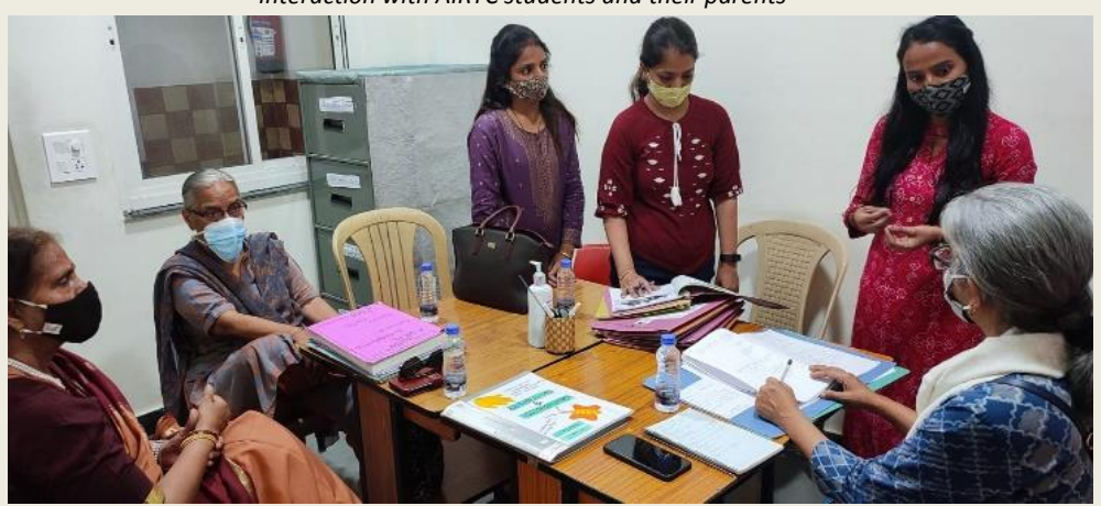
Meeting with Founder ASRA, Trustee and AIRTC staff and sharing of work / documents