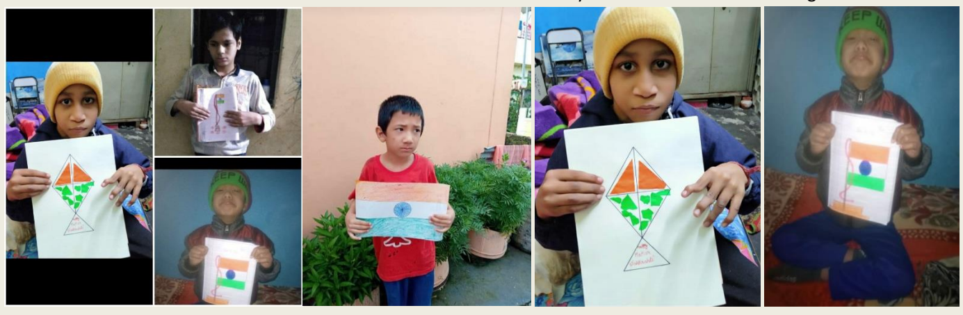
Children of AIRTC prepared handmade Tricolour Kites & National Flag during celebration of Republic Day Basant Panchami, 5<sup>th</sup> February 2022

Republic Day celebrations were held with great enthusiasm with children of AIRTC. Activities like Kite Making, Flag Making, Poem and Dance were conducted for the students. Photos of activities by students were shared during this celebration.