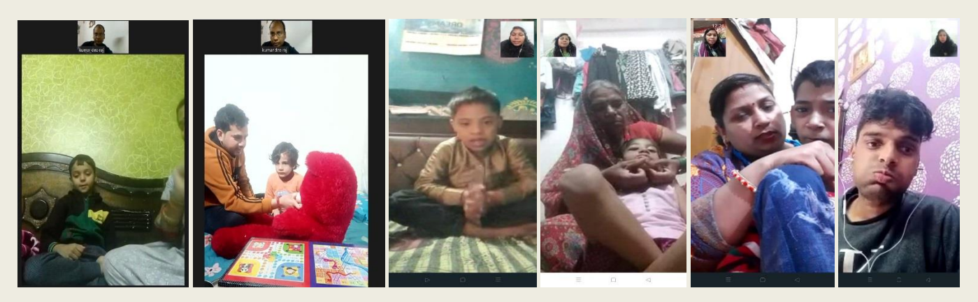
CwDs attending online Speech Therapy sessions