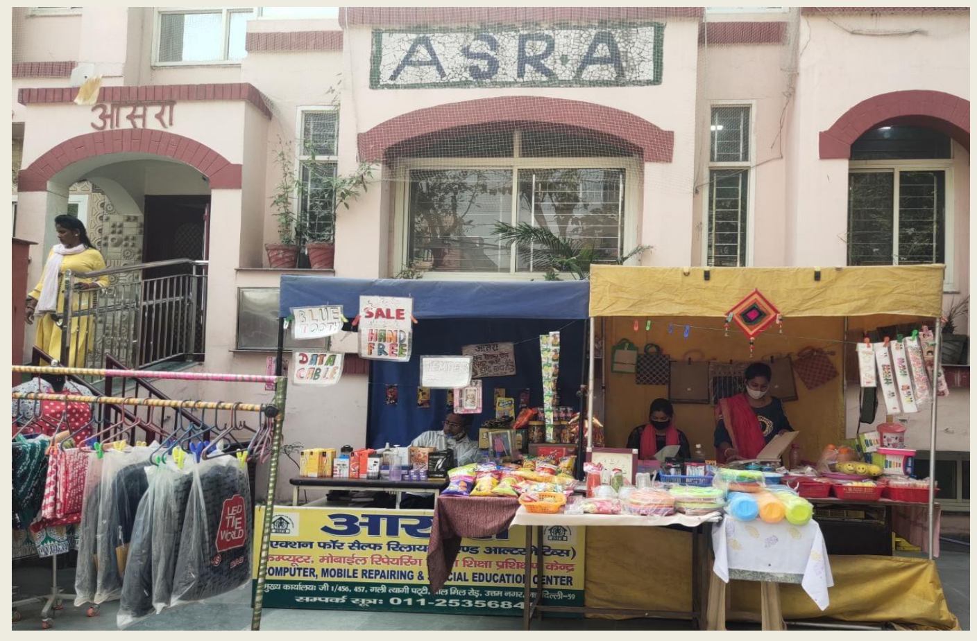
ASRA's Handicraft Haat and Mobile Repairing Haat at ASRA Head Office

In order to promote sale of masks and other material stitched in the Handicraft emporium, it was decided to display these products just outside the premises of ASRA Head Office. Haat also has provision for outlet services for clients in Mobile Repairing. Haat also worked as advertisements for vocational trainings such as Computer training, Mobile Repairing, Beauty Culture and Cutting & Tailoring courses.