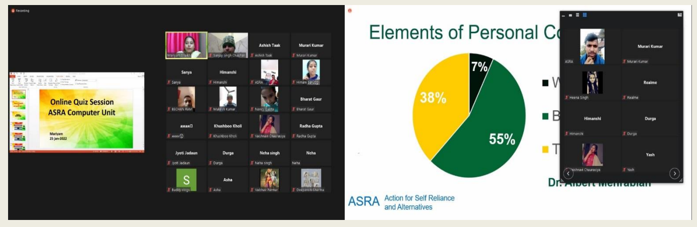
Webinar on Quiz Session on the occasion of Republic Day