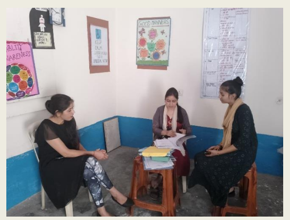
Vocational Training Incharge from ASRA Head Office guiding the newly appointed Tailoring Teacher

Need emerged from beneficiaries in Hoshiyarpur, NODIA to start the Vocational Training Program in Cutting & Tailoring. This was initiated in the newly rented room in NOIDA Centre . Also, a suitable needy person has been appointed as a teacher who has started conducting the classes from March 2022 onwards.