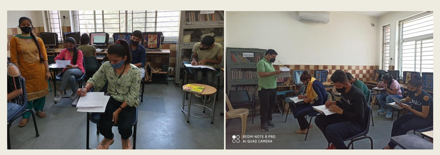
Students appearing for Internal Examination of Tally (left) and Basic Computer Course (right)

Examination: Students who have completed their Computer Course appeared for examination in the month of March 2022. Total no. of 30 students appeared in this Examination.