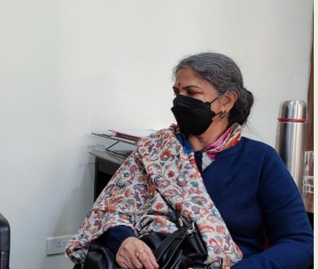
Addressal of queries by Founder, ASRA

Consequent upon this inspection, ASRA succeeded in fulfilling its objective partially. The RCI NOC has yet to be issued. Another Inspection will be conducted for the same. The renewal of Registration Certificate under RPwD Act, 2016 was granted to ASRA on 9th March 2022 which is valid upto 8th March 2027 (five years).