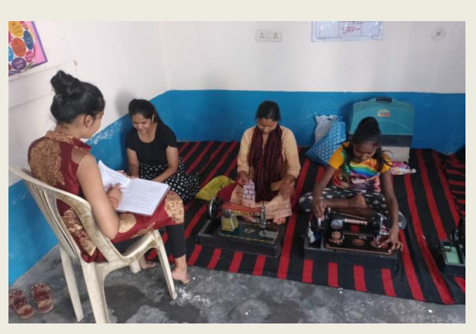
Cutting & Tailoring Class at Hoshiyarpur, NOIDA