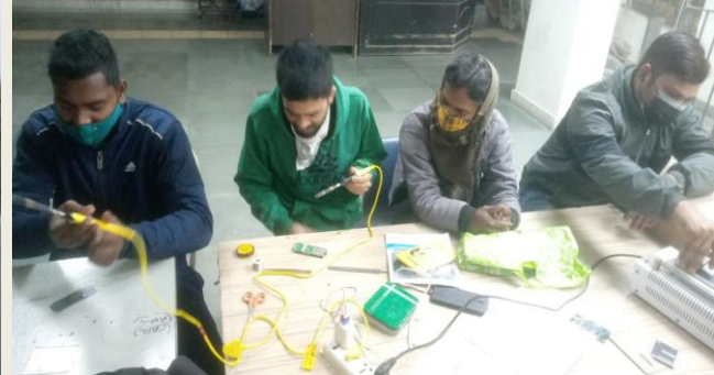
Mobile Repairing Class at ASRA Head Office