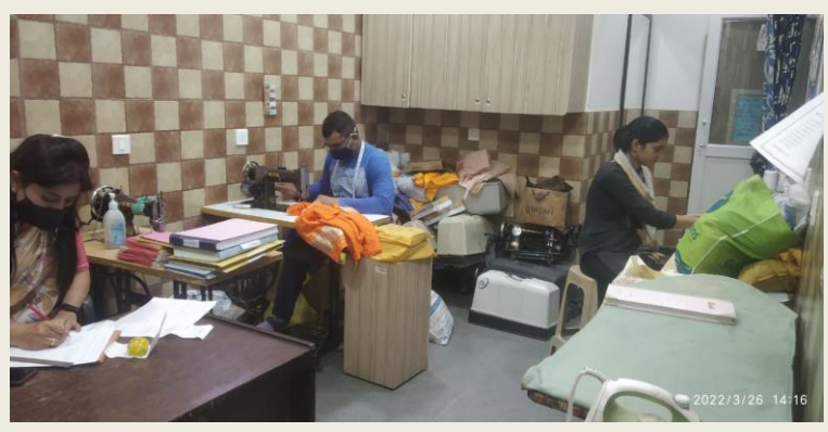
Order Work at ASRA Head Office

ASRA Handicraft Emporium has been functional since April 2010. The Emporium is taking orders of stitching / alteration work and repairing of clothes etc. Due to lockdown, order work and stitching of mask was done by tailoring staff from home.