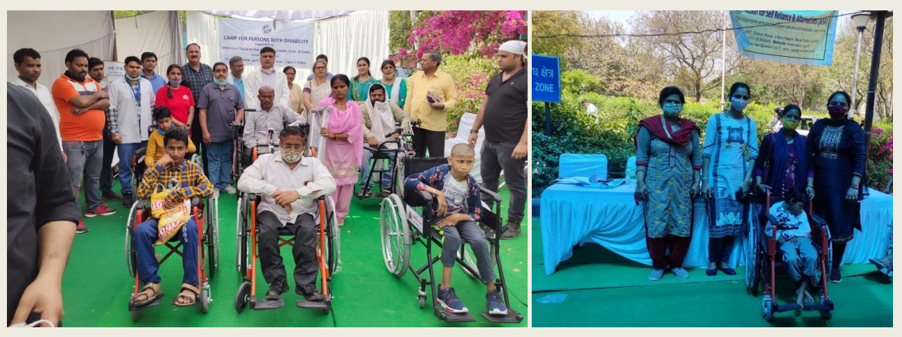
ASRA's PwD beneficiaries receiving Wheel chairs from Camp held at Rao Tula Memorial Hospital