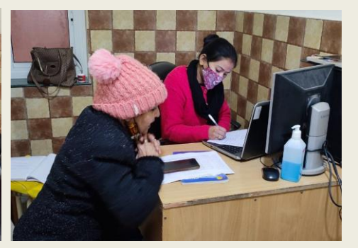
ASRA team constituted of staff of Head Office & CBR Rehab Workers contacting PwD beneficiaries telephonically