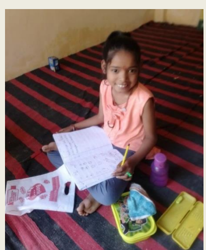
The Education Centre at Shiv Vihar