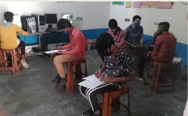
Students appearing in practical & theoretical examination after completing their course \ \ \, = \ \, (1-1)^{-1} \, (1-1)^{-1} \, (1-1)^{-1} \, (1-1)^{-1} \, (1-1)^{-1} \, (1-1)^{-1} \, (1-1)^{-1} \, (1-1)^{-1} \, (1-1)^{-1} \, (1-1)^{-1} \, (1-1)^{-1} \, (1-1)^{-1} \, (1-1)^{-1} \, (1-1)^{-1} \, (1-1)^{-1} \, (1-1)^{-1} \, (1-1)^{-1} \, (1-1)^{-1} \, (1-1)^{-1} \, (1-1)^{-1} \, (1-1)^{-1} \, (1-1)^{-1} \, (1-1)^{-1} \, (1-1)^{-1} \, (1-1)^{-1} \, (1-1)^{-1} \, (1-1)^{-1} \, (1-1)^{-1} \, (1-1)^{-1} \, (1-1)^{-1} \, (1-1)^{-1} \, (1-1)^{-1} \, (1-1)^{-1} \, (1-1)^{-1} \, (1-1)^{-1} \, (1-1)^{-1} \, (1-1)^{-1} \, (1-1)^{-1} \, (1-1)^{-1} \, (1-1)^{-1} \, (1-1)^{-1} \, (1-1)^{-1} \, (1-1)^{-1} \, (1-1)^{-1} \, (1-1)^{-1} \, (1-1)^{-1} \, (1-1)^{-1} \, (1-1)^{-1} \, (1-1)^{-1} \, (1-1)^{-1} \, (1-1)^{-1} \, (1-1)^{-1} \, (1-1)^{-1} \, (1-1)^{-1} \, (1-1)^{-1} \, (1-1)^{-1} \, (1-1)^{-1} \, (1-1)^{-1} \, (1-1)^{-1} \, (1-1)^{-1} \, (1-1)^{-1} \, (1-1)^{-1} \, (1-1)^{-1} \, (1-1)^{-1} \, (1-1)^{-1} \, (1-1)^{-1} \, (1-1)^{-1} \, (1-1)^{-1} \, (1-1)^{-1} \, (1-1)^{-1} \, (1-1)^{-1} \, (1-1)^{-1} \, (1-1)^{-1} \, (1-1)^{-1} \, (1-1)^{-1} \, (1-1)^{-1} \, (1-1)^{-1} \, (1-1)^{-1} \, (1-1)^{-1} \, (1-1)^{-1} \, (1-1)^{-1} \, (1-1)^{-1} \, (1-1)^{-1} \, (1-1)^{-1} \, (1-1)^{-1} \, (1-1)^{-1} \, (1-1)^{-1} \, (1-1)^{-1} \, (1-1)^{-1} \, (1-1)^{-1} \, (1-1)^{-1} \, (1-1)^{-1} \, (1-1)^{-1} \, (1-1)^{-1} \, (1-1)^{-1} \, (1-1)^{-1} \, (1-1)^{-1} \, (1-1)^{-1} \, (1-1)^{-1} \, (1-1)^{-1} \, (1-1)^{-1} \, (1-1)^{-1} \, (1-1)^{-1} \, (1-1)^{-1} \, (1-1)^{-1} \, (1-1)^{-1} \, (1-1)^{-1} \, (1-1)^{-1} \, (1-1)^{-1} \, (1-1)^{-1} \, (1-1)^{-1} \, (1-1)^{-1} \, (1-1)^{-1} \, (1-1)^{-1} \, (1-1)^{-1} \, (1-1)^{-1} \, (1-1)^{-1} \, (1-1)^{-1} \, (1-1)^{-1} \, (1-1)^{-1} \, (1-1)^{-1} \, (1-1)^{-1} \, (1-1)^{-1} \, (1-1)^{-1} \, (1-1)^{-1} \, (1-1)^{-1} \, (1-1)^{-1} \, (1-1)^{-1} \, (1-1)^{-1} \, (1-1)^{-1} \, (1-1)^{-1} \, (1-1)^{-1} \, (1-1)^{-1} \, (1-1)^{-1} \, (1-1)^{-1} \, (1-1)^{-1} \, (1-1)^{-1} \, (1-1)^{-1} \, (1-1)^{-1} \, (1-1)^{-1} \, (1-1)^{-1} \, (1-1)^{-1} \, (1-1)^{-1} \, (1-1)^{-1} \, (1-1)^{-1} \, (1-1)^{-1} \, (1-1)^{-1} \, (1-1)^{-1} \, (1-1)^{-1} \, (1-