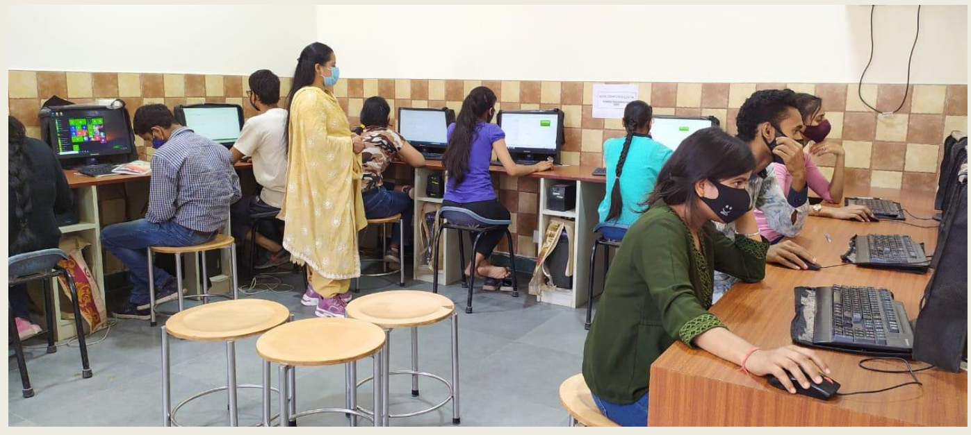
Practical Computer Classes at ASRA Head Office

Examination: Students who have completed their Computer Course appeared for examination in the month of March 2022. Total no. of 30 students appeared in this Examination.