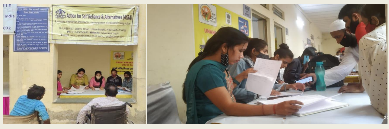
ASRA's Registration / Help Desk during camp at Guru Govind Singh Hospital