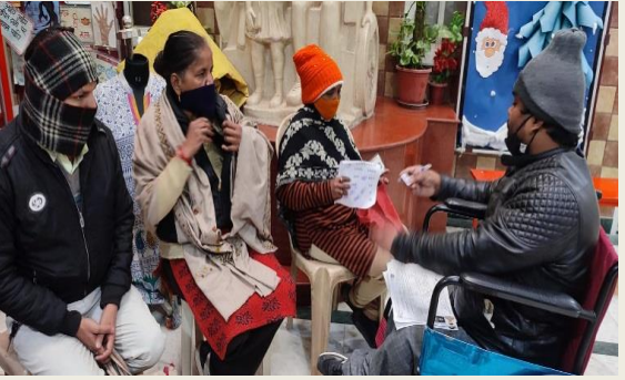
Some PwD beneficiaries came to ASRA Head Office and submitted their documents for online apply of Government facilities