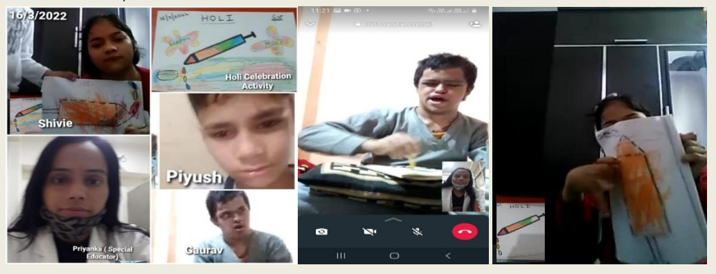
Children of AIRTC celebrated Holi festival via digitally

Children of AIRTC and teachers celebrated Holi, a festival of colours. The significance of the festival was discussed with them. They expressed their enthusiasm by applying dry colours to their family members. It was indeed a fun day and a joyful experience for children & their parents.