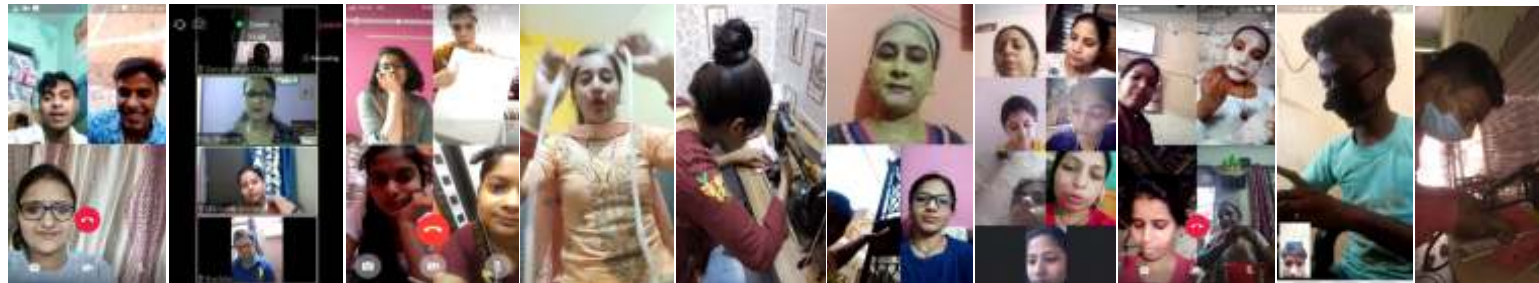
Online Computer Classes