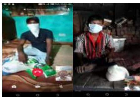
Procedural guidance provided to beneficiaries