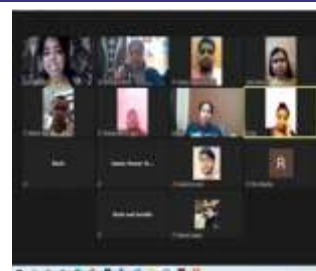
'Breathing Exercise in COVID-19' by Physiotherapy Department