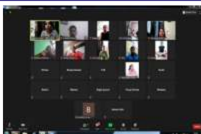
'Commit to Be Fit' organised by ASRA Physiotherapy Department