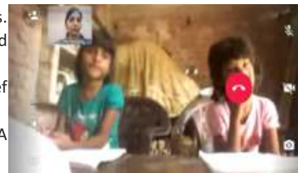
Online Education Classes