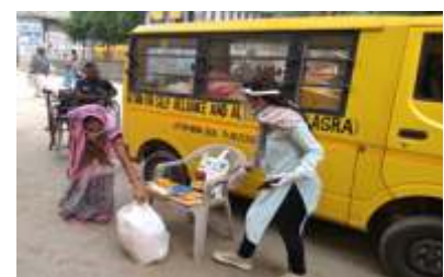
Seed Loan beneficiary from Shahbad Dairy slum community receiving essential item during distribution camp