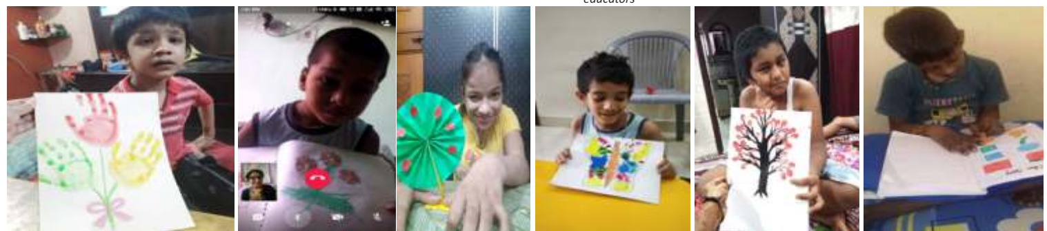
Drawing with hand and thumb painting