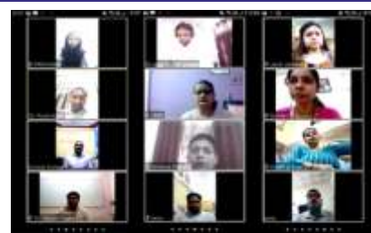
'Musculoskeletal problem's solution arisen during lockdown' organised by CBR-Physiotherapist