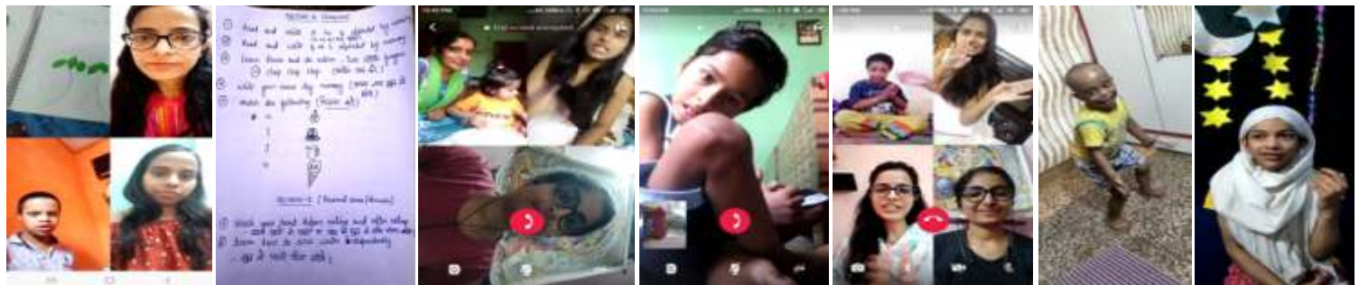
Online Special Education Classes & Worksheets prepared by Special Educators

While the AIRTC is physically shut due to lockdown, 34 children with special needs have availed services of AIRTC between April 2020 and June 2020. The children have different types of disabilities, predominantly intellectual disabilities associated with physical impairment. Some children also have speech & hearing impairment. Following is the classification of children of AIRTC students during the quarter under report: