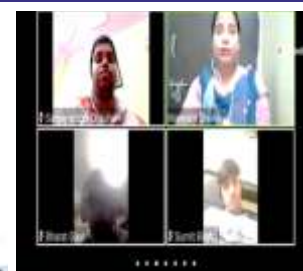
'Social Media' by Computer Department, ASRA HQ