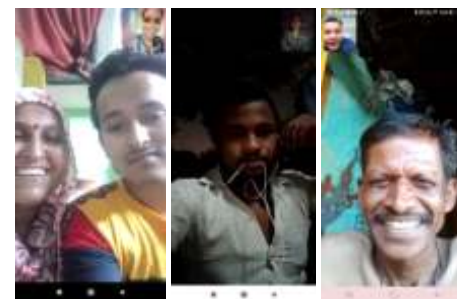
Online interaction with beneficiaries to provide information

Number of beneficiaries got information about COVID-19 disease and its Symptoms and preventions as below: