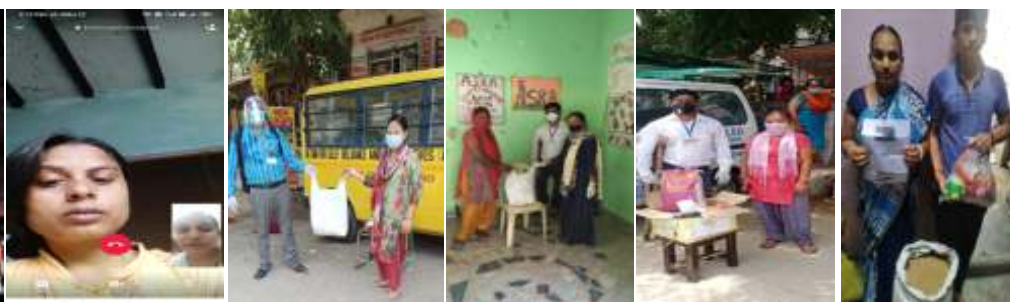
ASRAs beneficiaries receiving essential items