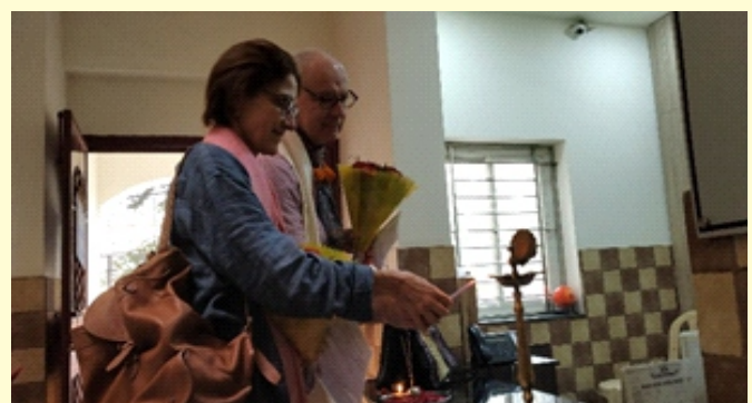
Lamp lighting by Honorable Delegates