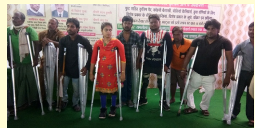
ASRA's beneficiaries receiving Mobility Aid & Appliances through Camps / Networking

d. Mobility Aids and Appliances: Total 87 PwDs/CwDs received mobility aids and appliances according to their needs such as Tricycle, Wheel Chair, Crutches, KFO/AFO, Hand Splint, Caliper, Hearing Aid, CP Chair, Special Shoes and Artificial Limb.