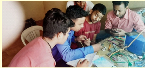
Mobile Repairing Class