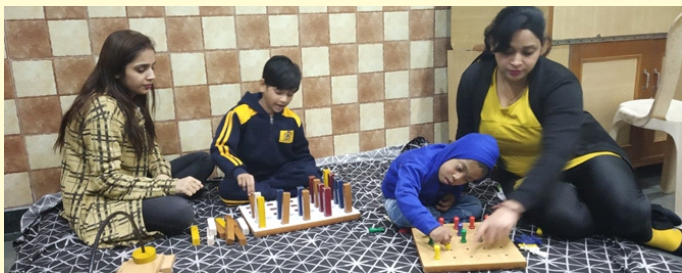
CwDs getting Occupational Therapy at ASRA HQ