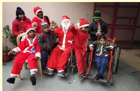
Celebration of Festivals - 'Dashehra', 'Diwali' and 'Christmas' with the Children of AIRTC