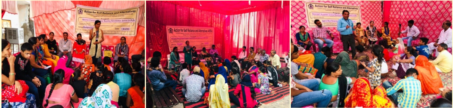
Community meeting held at Bindapur, Jahangir Puri and B-Block Raghuvir Nagar slum communities

a. Eight community meetings were held in adopted slum communities during the quarter under report which were attended by 302 people including 181 persons with disabilities.