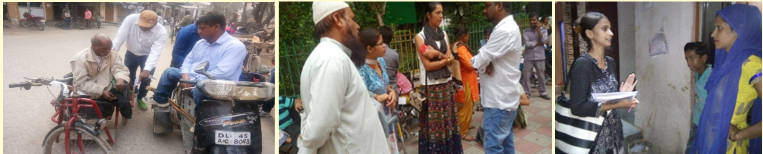
Updation of Required & Delivered (R&D) status along with procedural guidance about Welfare Schemes for PwDs

b. Individual and Group counselling sessions for 164 persons with disabilities and their family members were also organized in eight adopted slum communities.