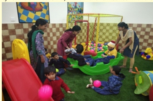
Children enjoying swings in play area