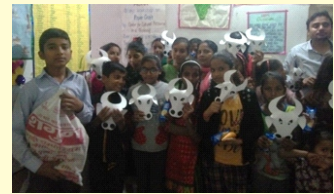
Students of ASRA Education Centre during activity