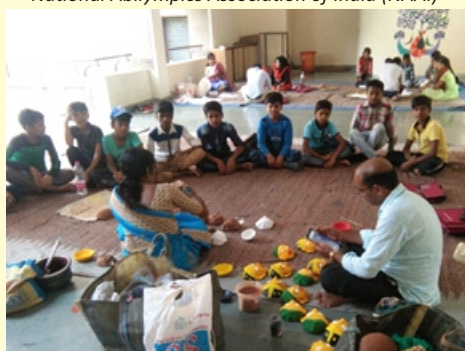
Children of ASRA's Education centre during workshop held at Cultural program held at CCRT campus