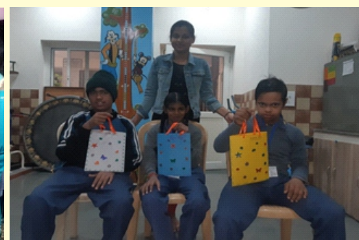
CwDs during workshop on 'Paper Bag Making' at ASRA HQ