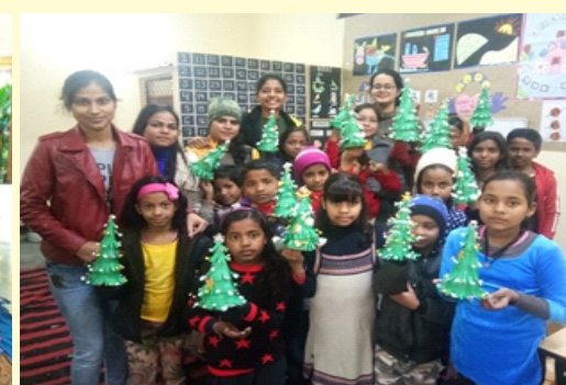
Workshop on 'Christmas Tree' at CBR Project Office, Pappan Kalan