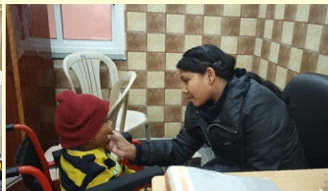
A Child getting Speech Therapy at ASRA HQ