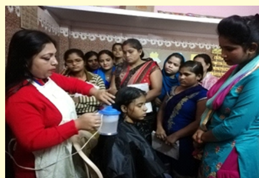
Workshop on 'Hair Care & Spa' held at Dwarka Sec-16 slum community