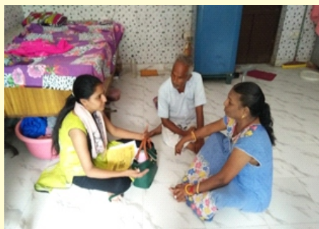
Updation of Required & Delivered (R&D) status along with procedural guidance about Welfare Schemes for PwDs

b. Individual and Group counselling sessions for 164 persons with disabilities and their family members were also organized in eight adopted slum communities.