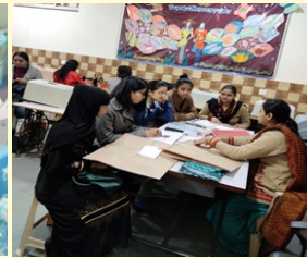
Tailoring Class at ASRA HQ