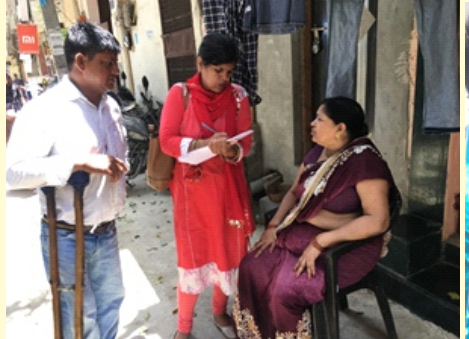
c. Individual and Group counselling sessions for 634 persons with disabilities and their family members were also organized in eight adopted slum communities.