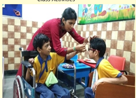
Activities during celebration of festival-Raksha Bandhan