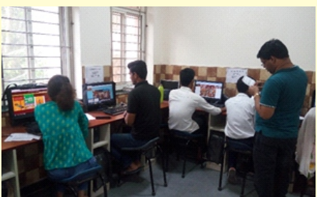
Quiz Competition on Independence Day (left) and Website Designing at ASRA HQ