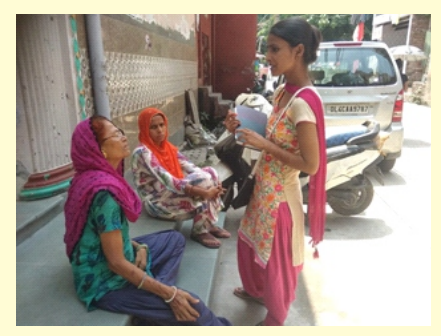
Updation of Required & Delivered (R&D) status along with procedural guidance about Welfare