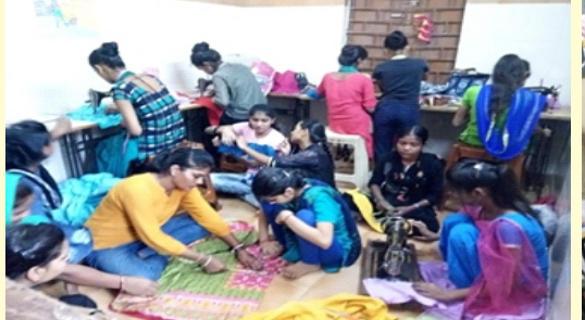
Workshop on 'Usha Janome Creative machine' (left) and 'Creative Pillow & Cushion Cover' (right) at ASRA HQ