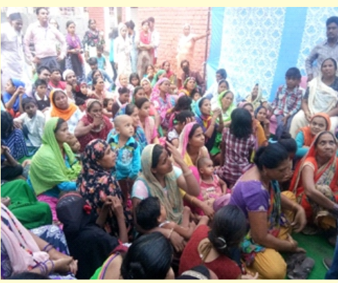
Community meeting held at Dwarka sec-16, Jahangir Puri and Bawana slum communities