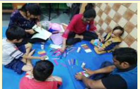
CwDs during workshop on 'How to make Pen Stand' at ASRA HQ