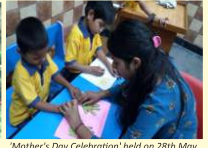
'Mother's Day Celebration' held on 28th May, 2019 at ASRA HQ