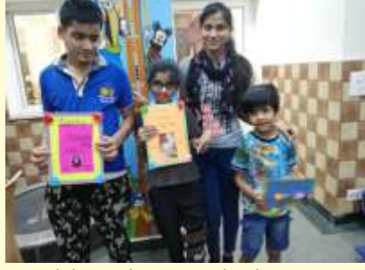
Workshop on 'Scenery Making' at ASRA HQ