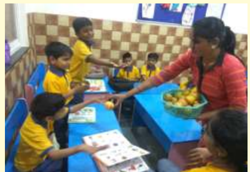
Refreshment for children