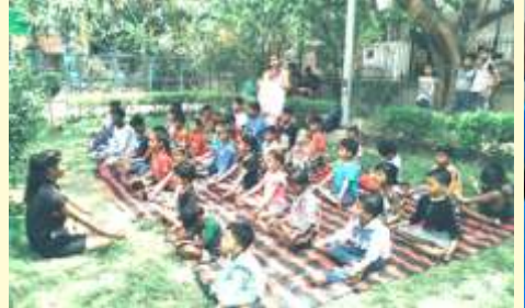
Yoga session with children of Education Program during 'The International Day of Yoga'