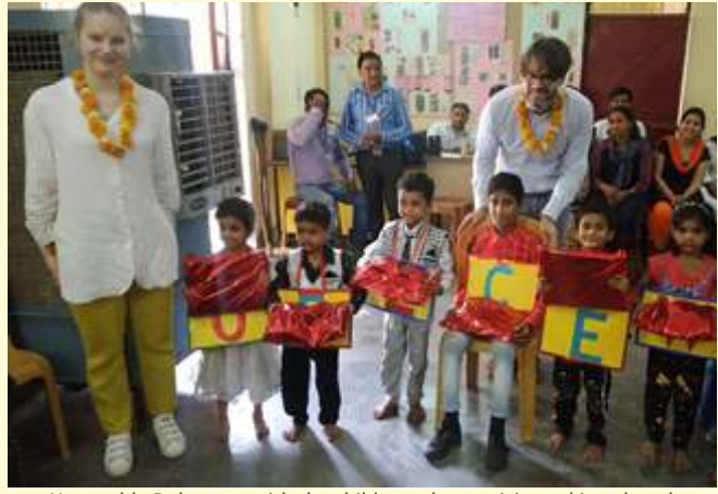
Honorable Delegates with the children who participated in cultural program at ASRA CBR Project Office