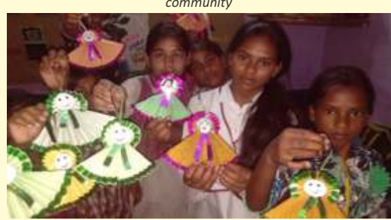
Workshop on 'Paper Dolls Making' held at Pappan Kalan slum community