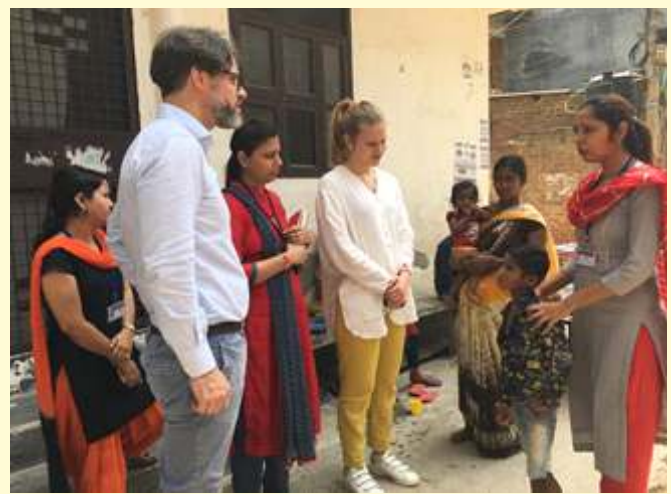
Home visit of ASRA's beneficiary (CwD) in Pappankalan community