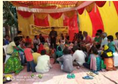
Community meeting held at Razapur, Bakkarwalan and Bindapur slum communities