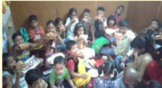
Workshop on 'Food without Fire' held at Nanhe Park slum