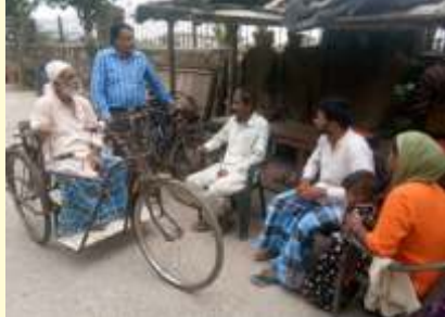
c. Individual and Group counselling sessions for 132 persons with disabilities and their family members were also organized in eight adopted slum communities.