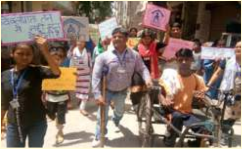
Two 'Disability Awareness Rallies' were held in adopted slum communities during the quarter under report.