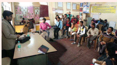
Workshop on Maintenance of Motorized Tricycle organised by ALIMCO held at CBR Project Office Pappan Kalan slum community