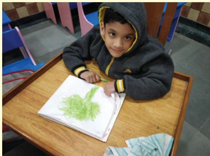
Class room activity