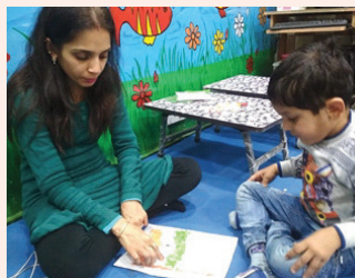
A CwD during Flag Making workshop at ASRA HQ