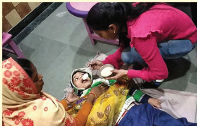
A CwD having meal at AIRTC