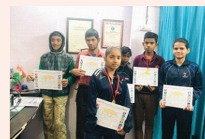
A glimpse of sponsored CwDs winning Awards in games held in their respective school