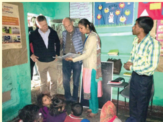
Home visit of a beneficiary along with CBR Therapist at Nanhe Park slum community (left) and at Education Centre in Kirbi Place slum community (right)