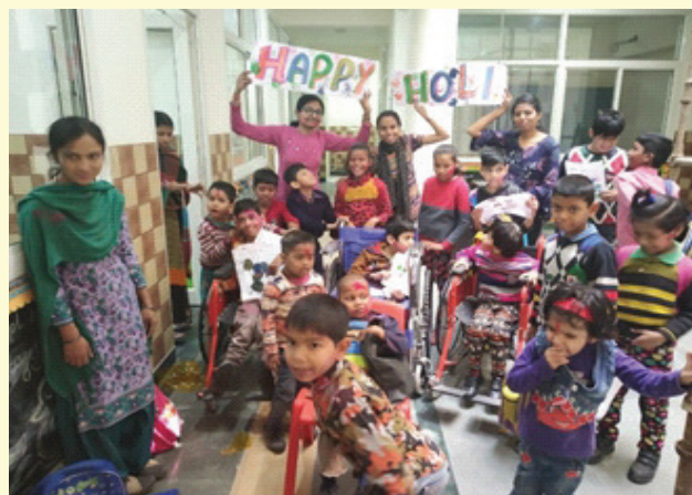
Celebrated Republic Day (left) and Holi at AIRTC (right)