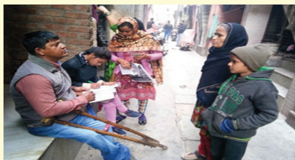
ASRA's Rehabilitation Worker and Asst. CBR Coordinator updating the Required & Delivered status of Persons with Disabilities (PwDs) in adopted slum communities