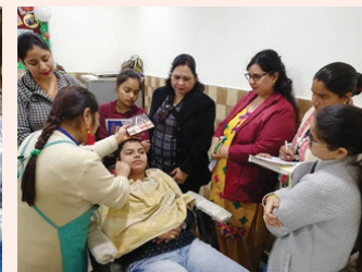
Workshop on Every Day Makeup at ASRA HQ