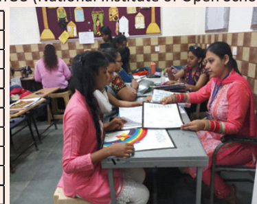
Tailoring Class at ASRA HQ