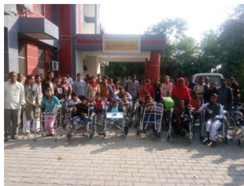
Beneficiaries of ASRA receiving mobility aids during a camp