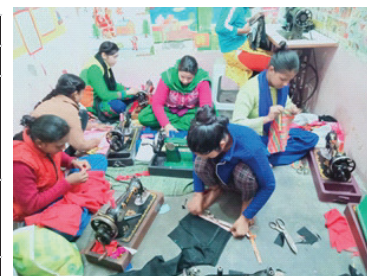
Students appearing in Examination at Vocational Training Centres under ASRA CBR Project