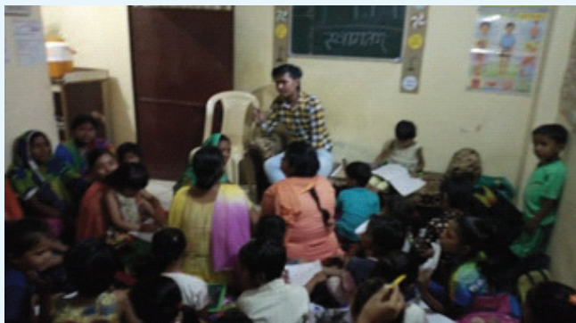
Newly opened Education Centre in 'Majnu Ka Tila' slum community

One new Education Centre has been opened in ASRA's adopted slum community 'Majnu Ka Tila' during the quarter under report.