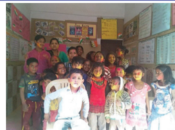
Celebrating Holi at Education Centre, Nanqli Dairy slum community