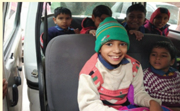
ASRA cab and a rented vehicle is used for pick and drop of CwDs from slum communities