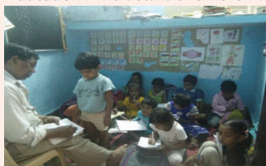
Children attending education class at Razapur slum community