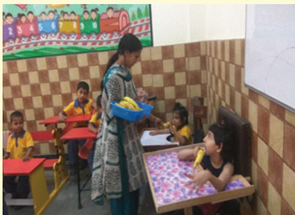
Refreshment being distributed for children