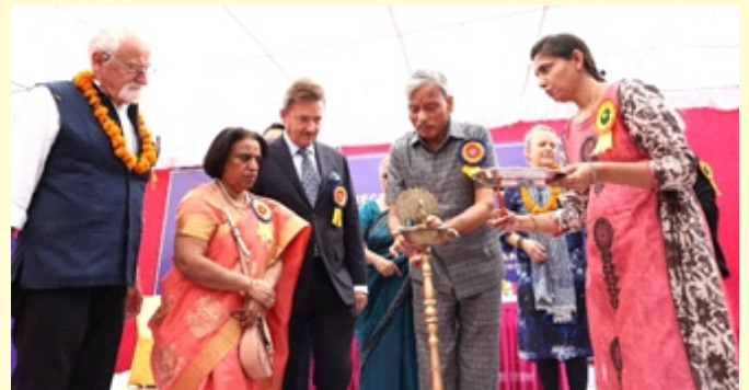
Lamp Lighting by the Chief Guest