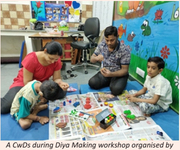
A CwDs during Diya Making workshop organised by Occupational Therapy Department at ASRA HQ