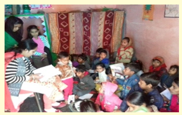
Newly opened Education Centre in Golden Park slum community

One new Education Centre has been opened in ASRA's adopted slum community, 'Golden Park' during the quarter under report.