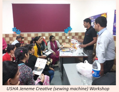
held at ASRA HQ