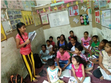
Children attending education class at Pappan Kalan community