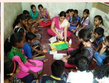
Children of Education Program attending workshop on 'Paper Bag' at Pappan Kalan Community