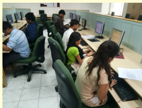
Participants from ASRA during NAAI competition