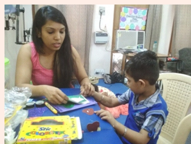
Children of Occupational Therapy attending workshop on 'Preparation of Greeting Cards Mother's Day'