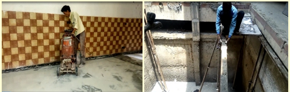
Construction of ASRA Special School

The construction of ASRA's Special School started on 27th March 2017. This school will cater to the needs of special children who are living in the nearby slum communities and some of them are supported under ASRA's present Sponsorship Program.