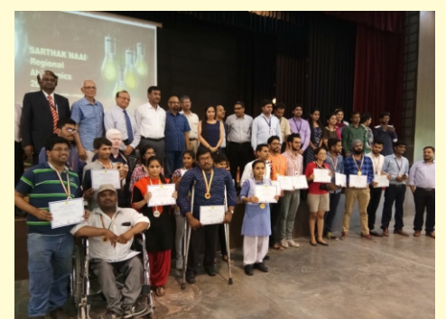
Winners from ASRA along with other winners and organizers of NAAI