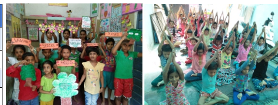
Children of Education Centre celebrated 'World Environment Day' at Pappan Kalan community (Left) and 'International Yoga Day' at Dwarka sec-16 community (Right)