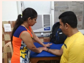
Patient getting therapy in Physiotherapy Unit, ASRA Head quarter ARTC