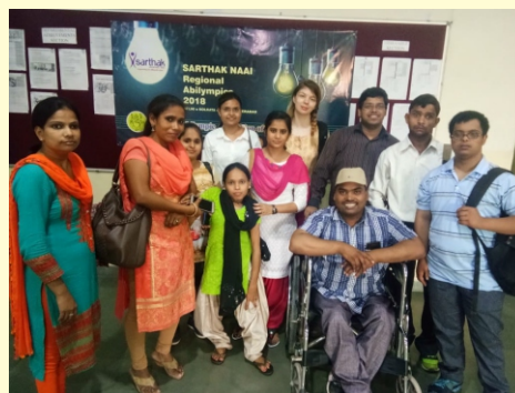
ASRA's staff / students at the venue of NAAI Competitions, NOIDA