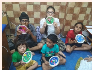
Children of Occupational Therapy attending workshop on 'Paper Plates Decoration'