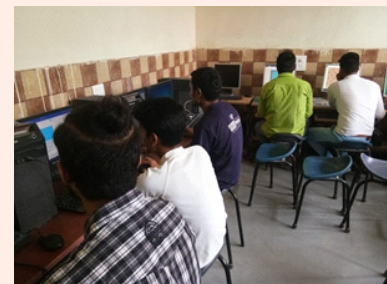
Students attending practical class at ARTC