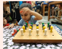
A CwD patient in OT Department getting therapy of holding strength