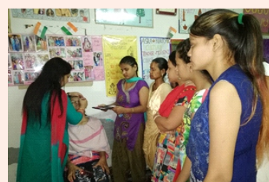
Children of Education Program attending workshop on 'Casual' at Pappan Kalan Community