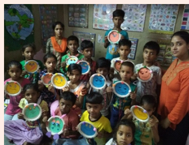
Children of Education Program attending workshop on 'Paper Plates Decoration' at Shiv Vihar Community