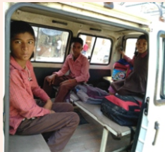
ASRA's sponsored CwD