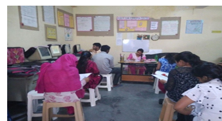
Theory Exam in Computer at Pappankalan community