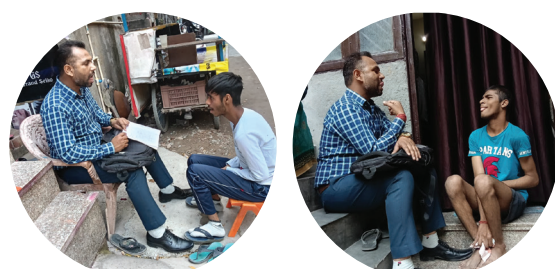
SOME GLIMPSES OF DOOR TO DOOR SPEECH THERAPY SESSIONS IN ADOPTED SLUM COMMUNITIES