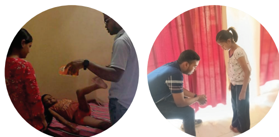
SOME GLIMPSES OF DOOR TO DOOR PHYSIOTHERAPY SESSIONS IN ADOPTED SLUM COMMUNITIES