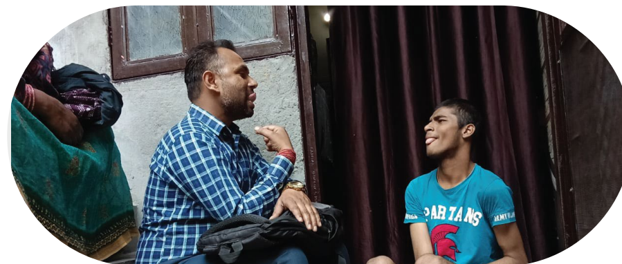
SOME GLIMPSES OF DOOR TO DOOR SPEECH THERAPY SESSIONS IN ADOPTED SLUM COMMUNITIES