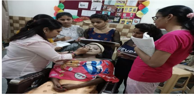
Students attending Beauty Culture class at ASRA Head Office