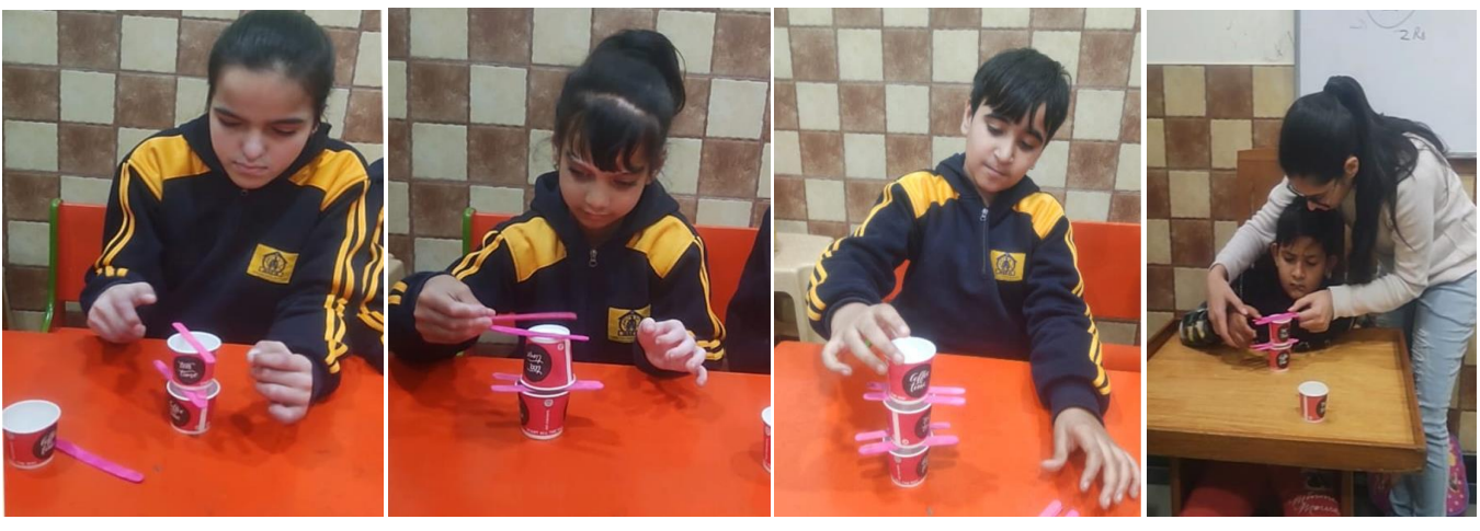
Workshop on Balance with eye hand coordination conducted by Special Educator for Children of AIRTC Special School