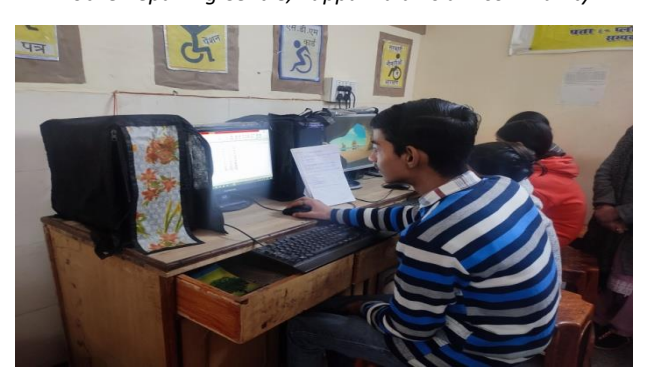
Computer Centre, Pappankalan slum community