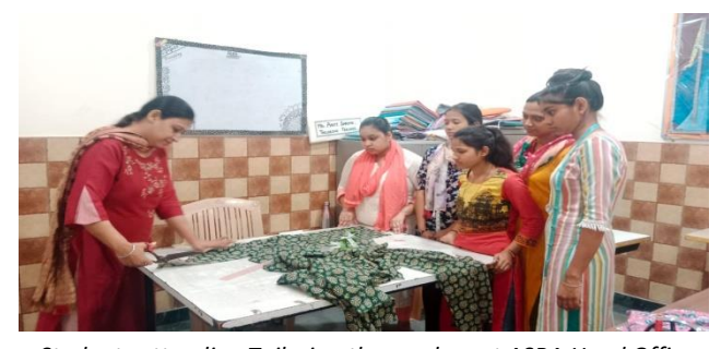
Students attending Tailoring theory class at ASRA Head Office