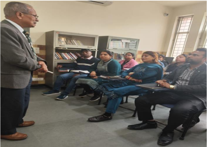
Workshop on Suryanamaskar (Yoga) at Shiv Vihar Education Centre