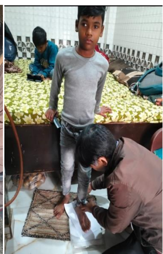
Prince 10/M of Dwarka Sec-16 community taken measurement of surgical shoes